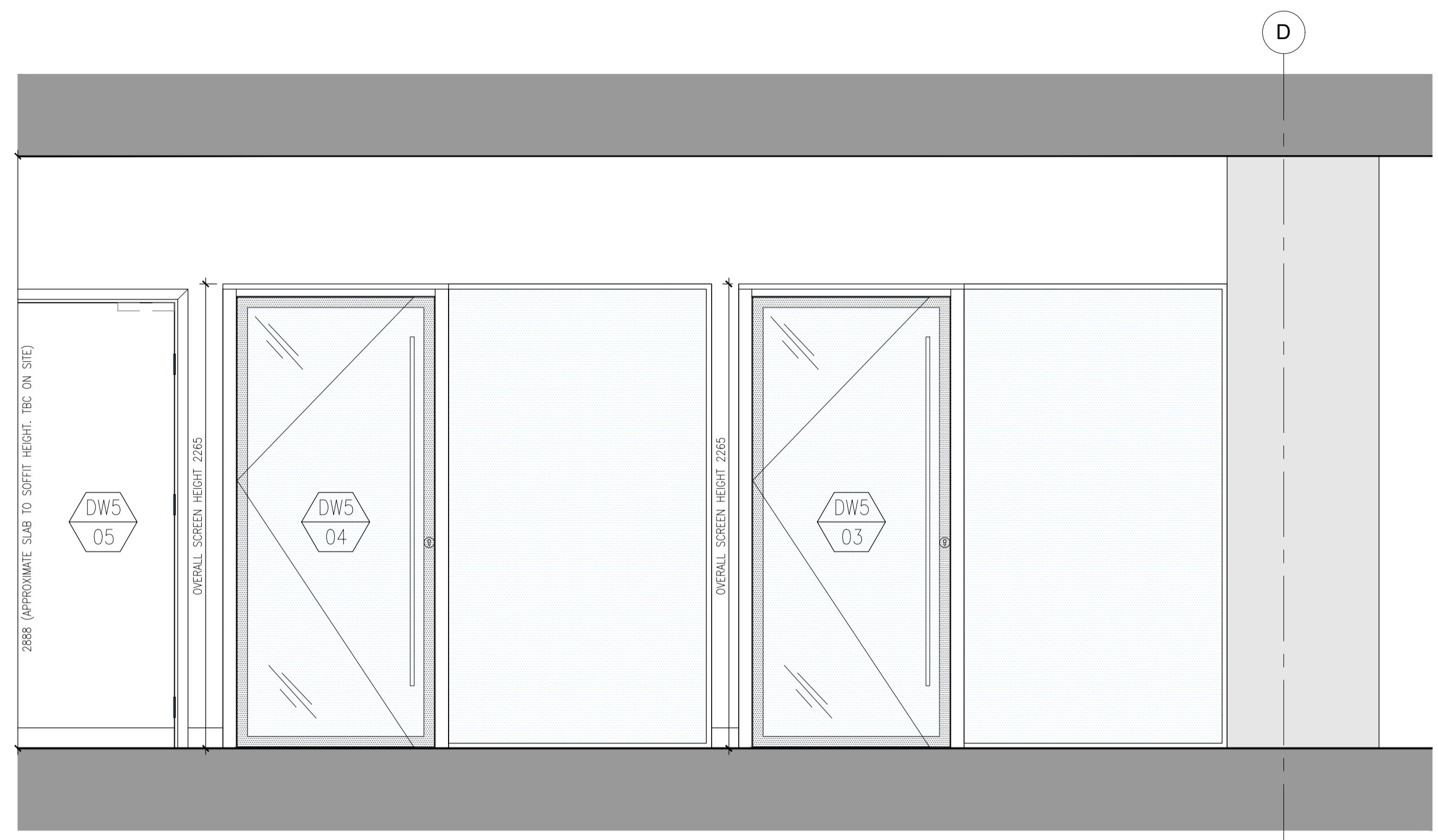
1 LEVEL 5 INTERNAL ELEVATION – RM05.04 MEETING ROOM & RM05.03 OFFICE SCALE 1:20

GENERAL NOTES THIS DRAWING IS THE COPYRIGHT OF MACE DESIGN. DO NOT SCALE THIS DRAWING. ALL DIMENSIONS TO BE CHECKED ON SITE BEFORE ANY WORKS PROCEED. THE CONTRACTOR IS TO PROVIDE FULL SIZE SETTING OUT DRAWINGS BASED ON THE INFORMATION CONTAINED IN THIS DRAWING FOR THE DESIGNERS APPROVAL PRIOR TO COMMENCING MANUFACTURE. THE DRAWING IS ISSUED ON THE CONDITION THAT IT IS NOT REPRODUCED, RETAINED OR DISCLOSED TO ANY UNAUTHORISED PERSON EITHER WHOLLY OR IN PART WITHOUT THE WRITTEN CONSENT OF MACE DESIGN. THIS DRAWING SHOULD BE READ IN CONJUNCTION WITH ALL RELATED DRAWINGS AND SPECIFICATIONS. ALL WORK IS TO BE CARRIED OUT IN ACCORDANCE WITH THE APPROPRIATE BUILDING REGULATIONS AND CODE OF PRACTICE WHERE SUCH EXIST AND GENERALLY TO CONFORM WITH GOOD BUILDING PRACTICE.