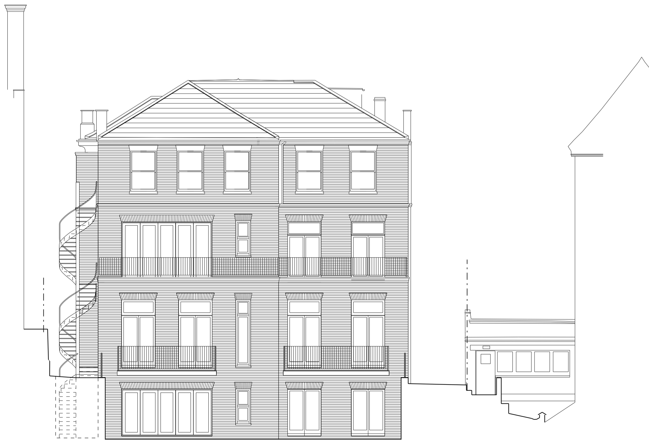
Existing Approved Rear Elevation