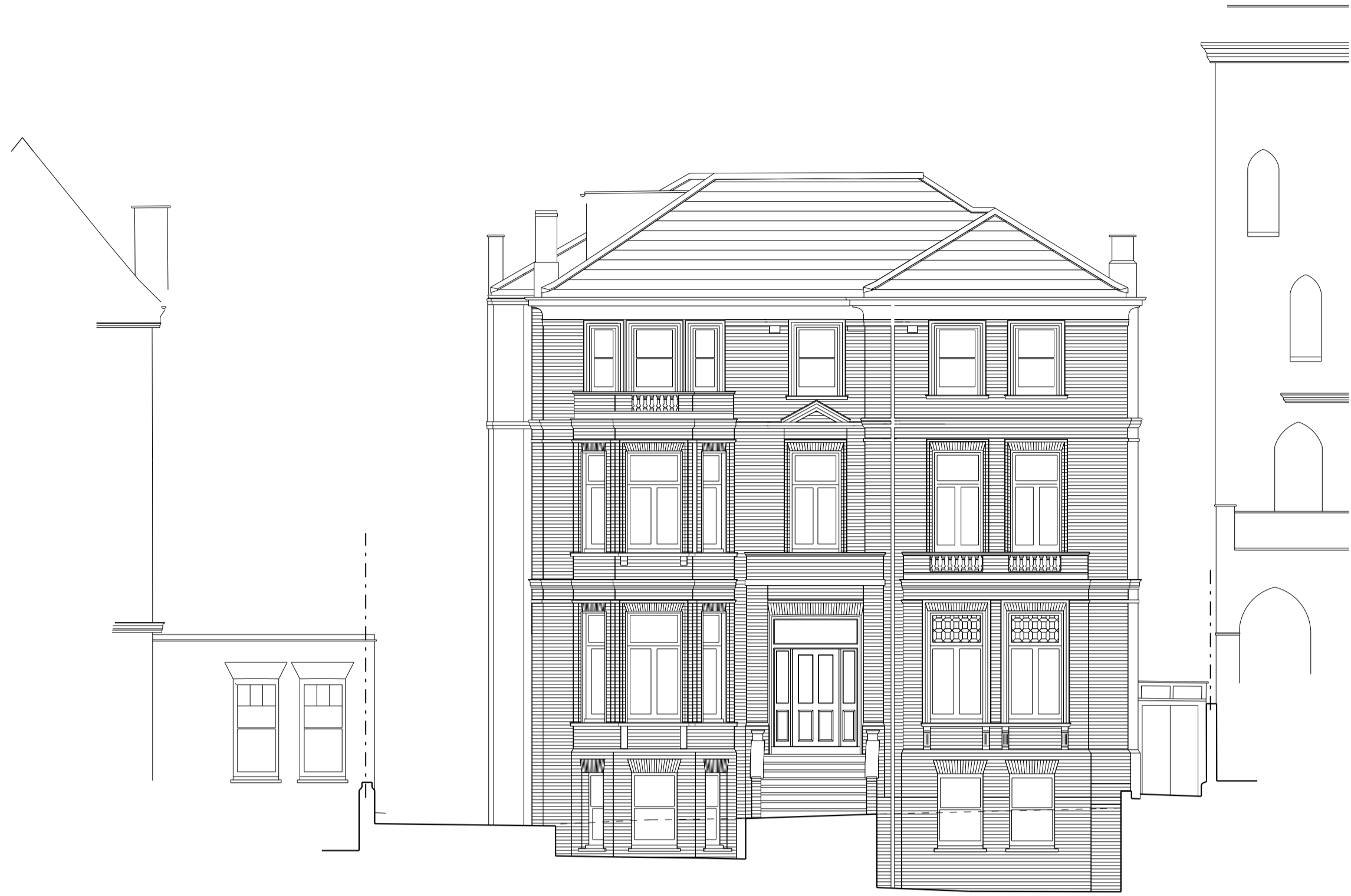
Existing Approved Front Elevation