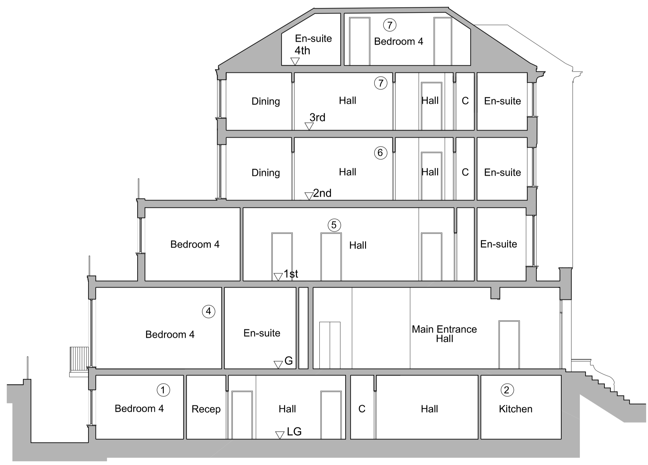
Proposed Section 2-2