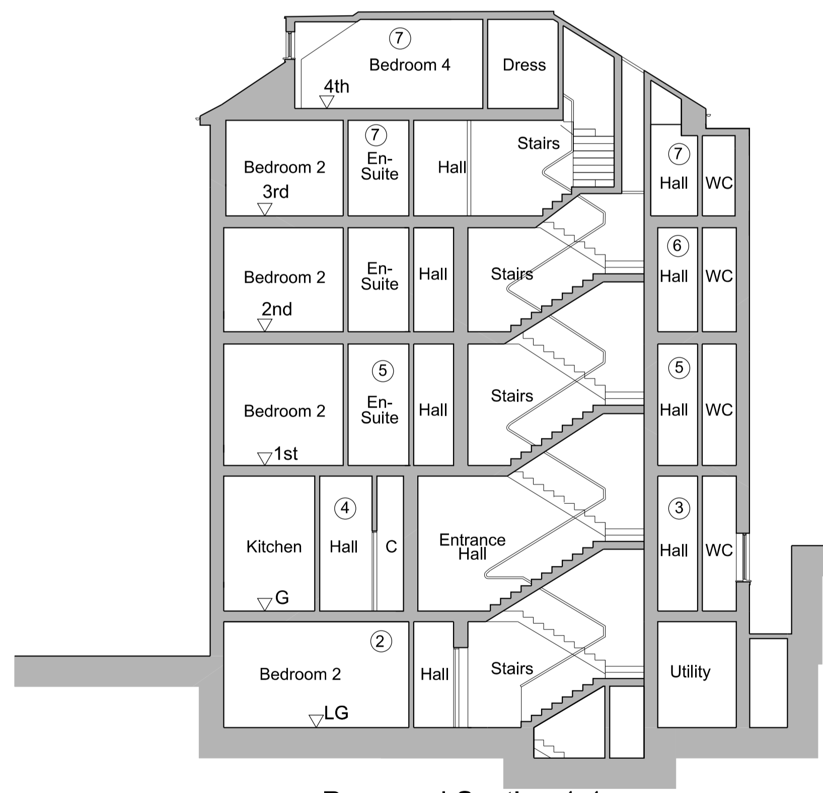
Proposed Section 1-1