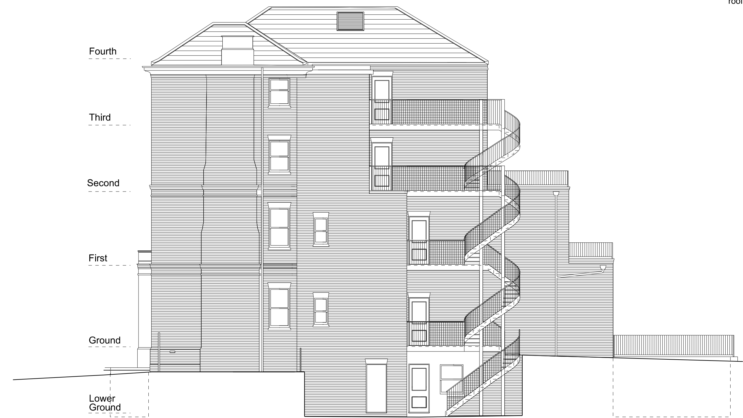
Proposed Side Elevation (North)