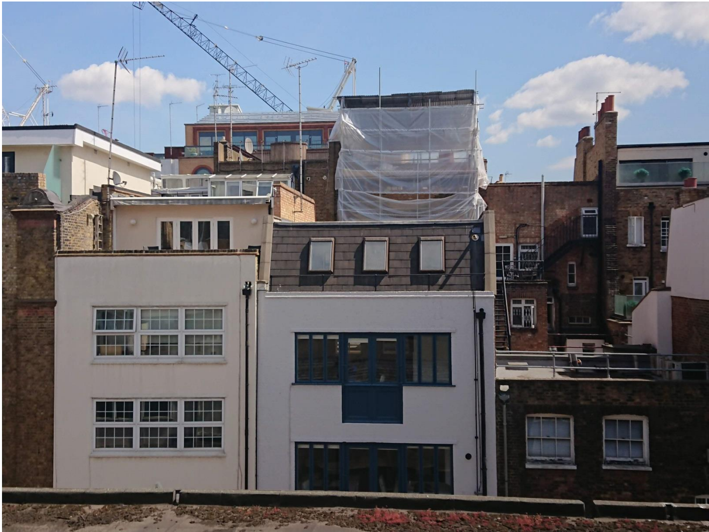
Proposed View A