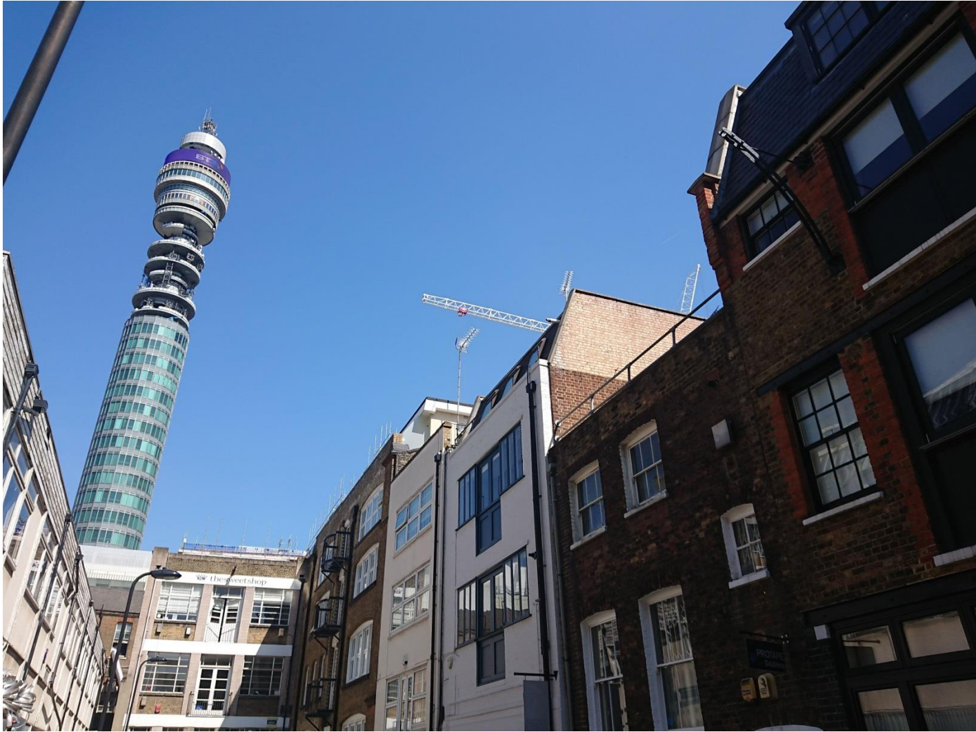
Proposed View C