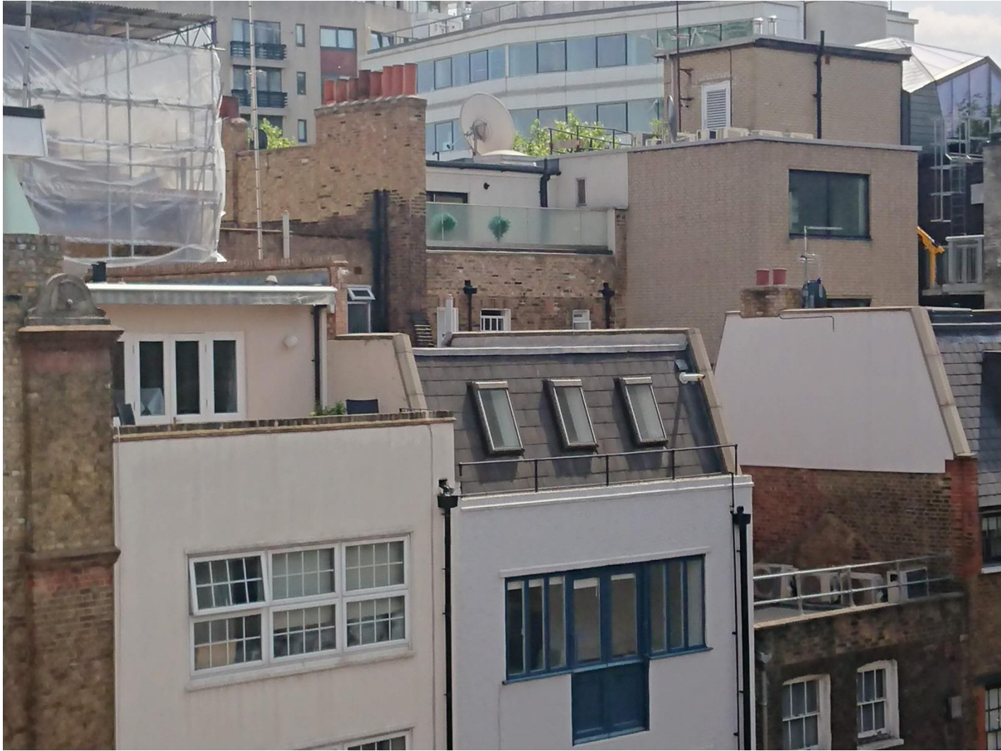
Proposed View B