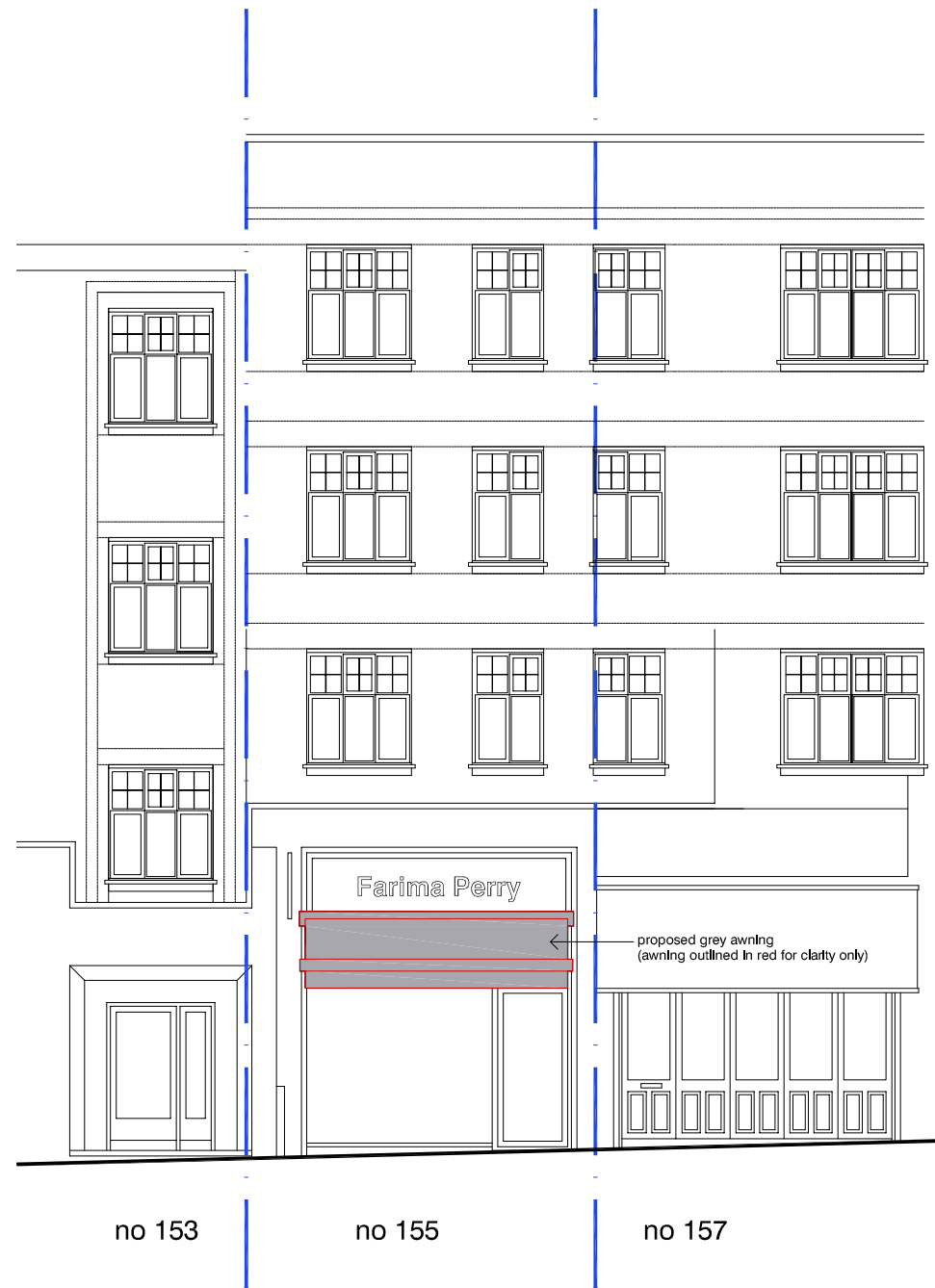
elevation as proposed