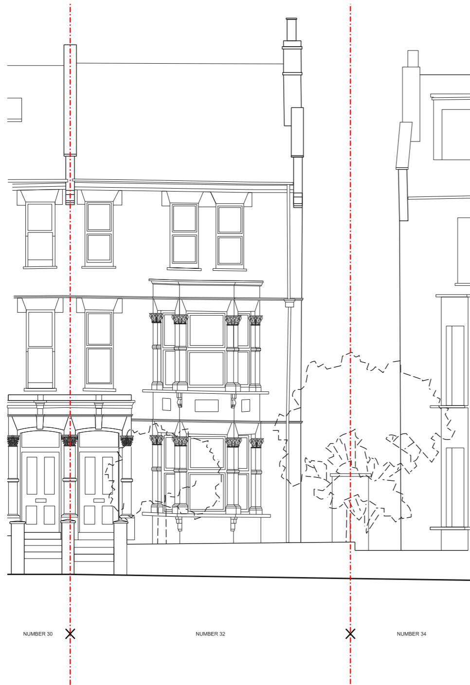
01 EXISTING SOUTH ELEVATION 1:50@A1 1200