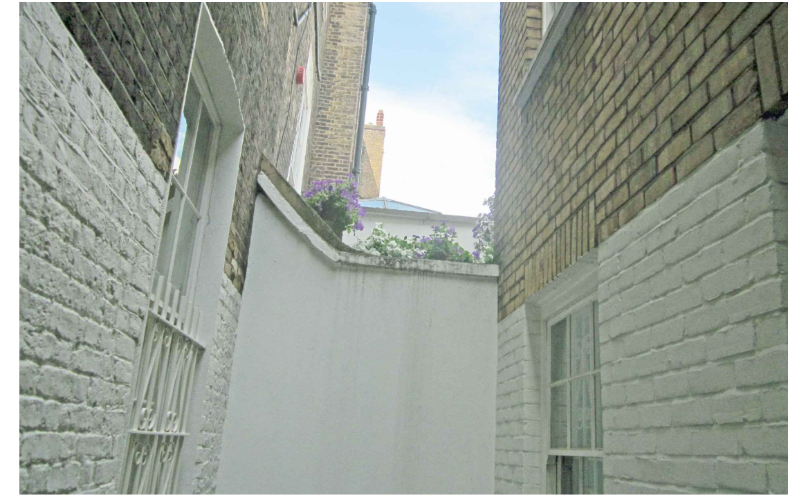
EXISTING BOUNDARY WALL