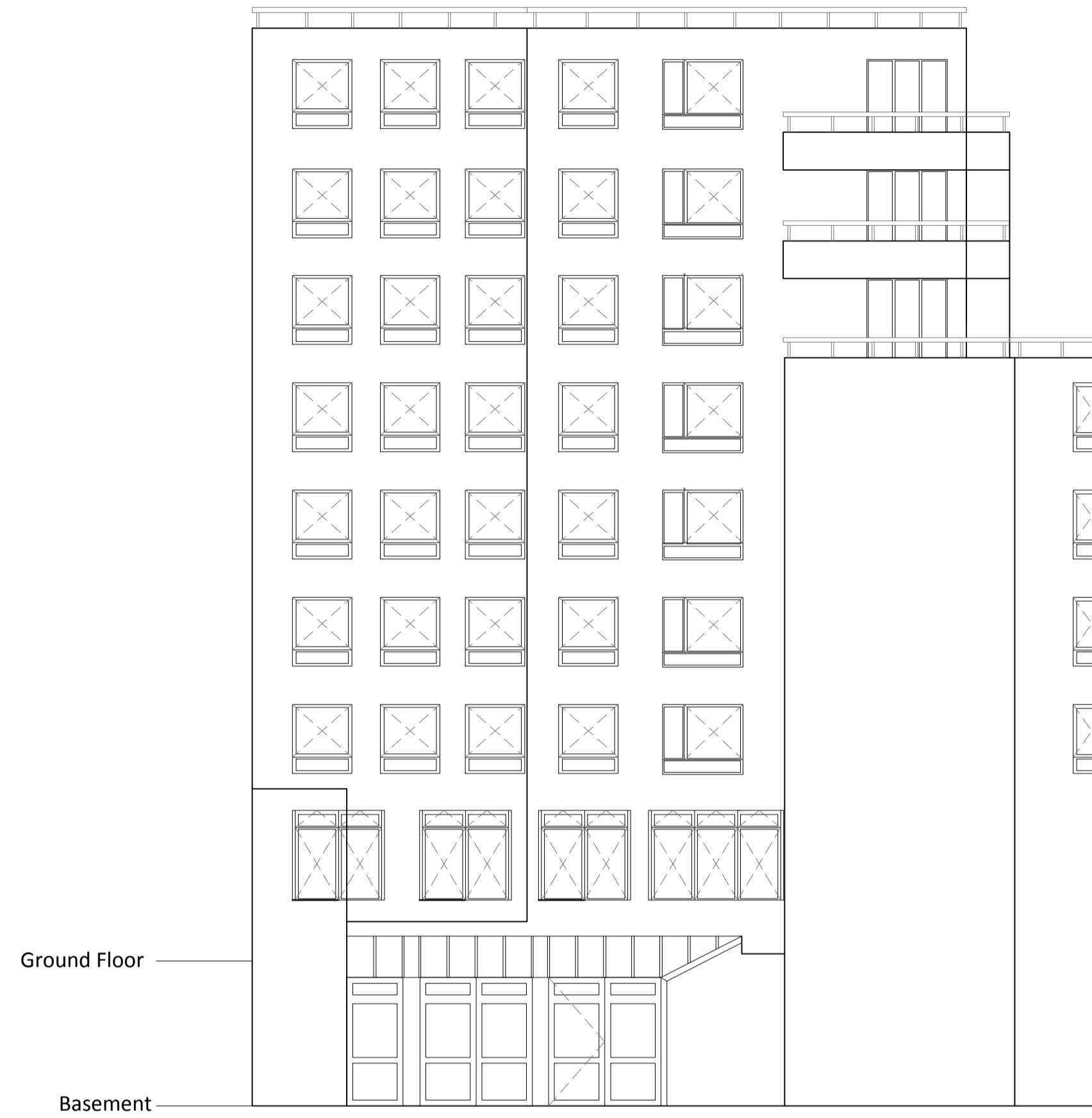
Courtyard - West Elevation