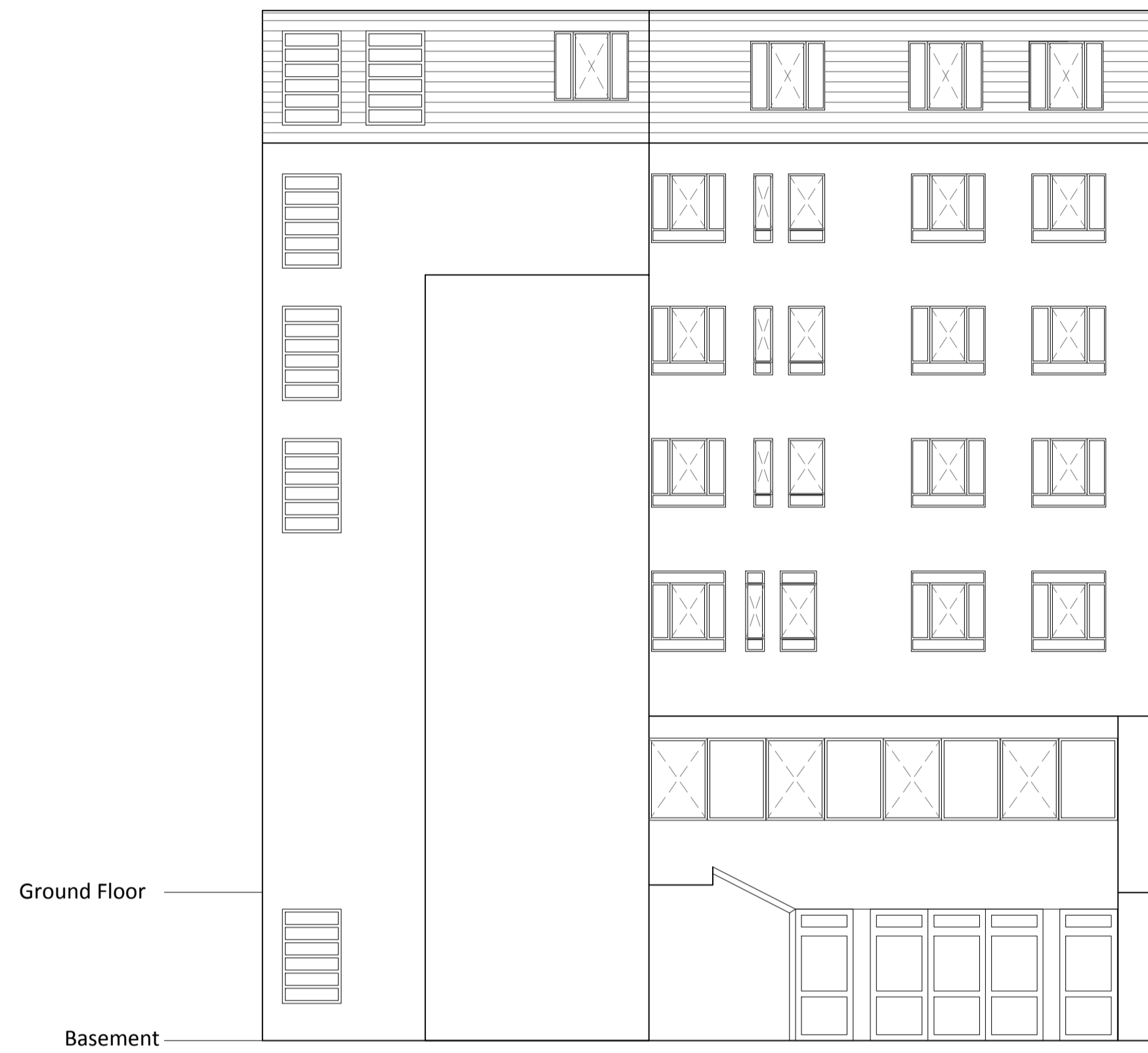
Courtyard - South Elevation