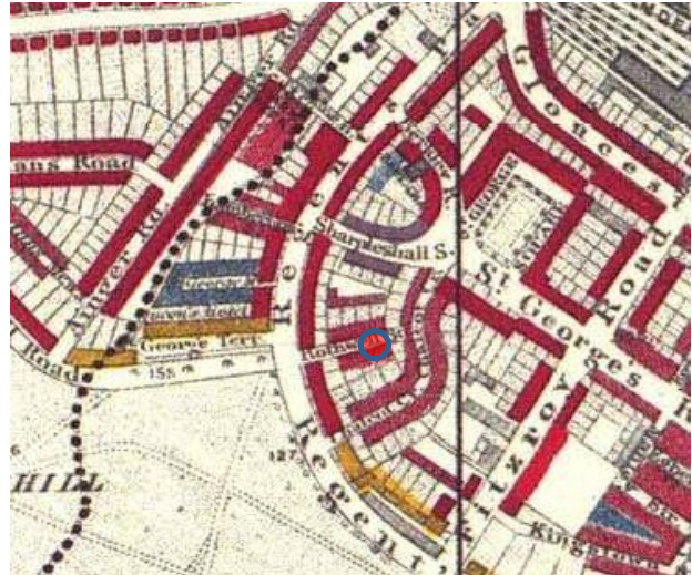
1889 Charles Booth's Poverty Map