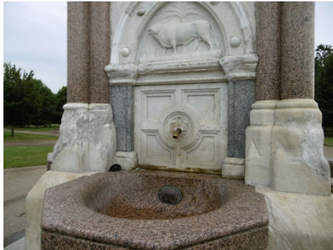
Fig. 5 - Ferrous staining around pipes