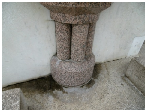
Fig. 4 - Limescale build up at the base of pedestals is in a better condition than previously reported and appears to have been cleaned