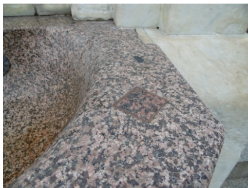
Fig. 8 - Joints to previous piecing in have recently been filled