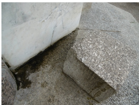
Fig. 9 - Chipped corners to stone stepping blocks