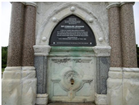
Fig. 3 - Green staining beneath plaque