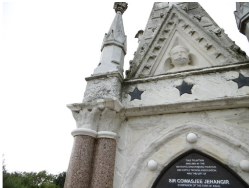
Fig. 1 - Friable original marble