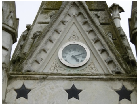
Fig. 6 - Cracked glass to clock