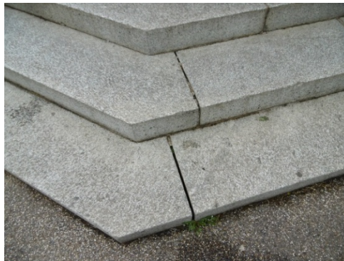
Fig. 2 - Open joints to steps