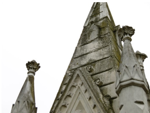
Fig. 7 - Missing finial to east elevation