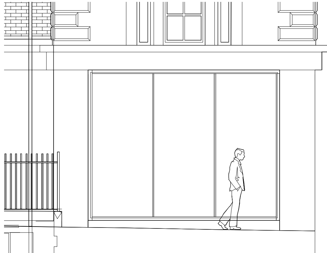
1 Existing Bloomsbury Street Elevation Scale: 1:50