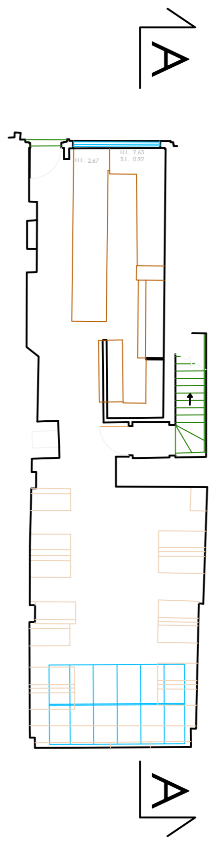
existing floor plan scale - 1:100 @ A1