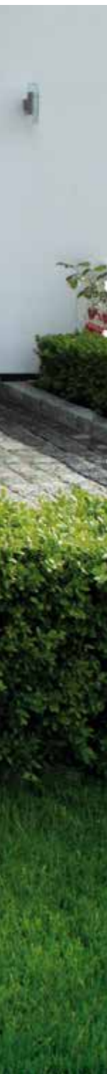
Granite Setts, Beige laid in a fan pattern