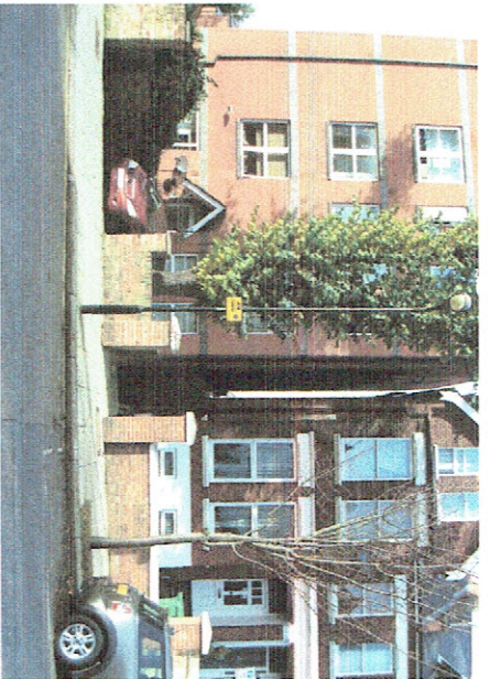
LOCATION WITHOUT POLE Brick pier on the boundary line between 14 and 16 Minster Road.