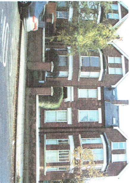
LOCATION WITHOUT POLE Brick pier on the boundary line between 13 and 15 Minster Road.