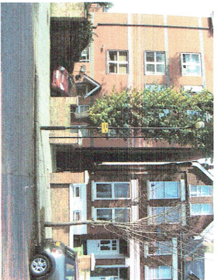
LOCATION WITH POLE Brick pier on the boundary line between 14 and 16 Minster Road with the proposed pole adjacent to the centre line of pier.