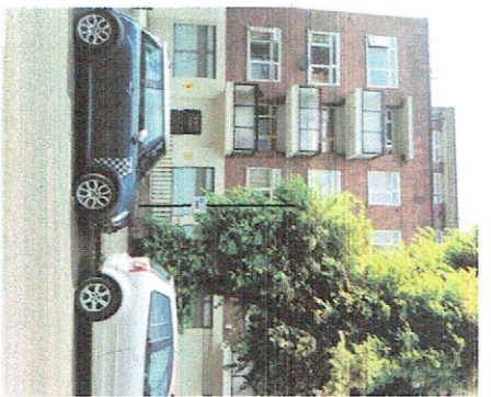
LOCATION WITH POLE PARKING POLE RELOCATED EXTENDED AT REAR OF FOOTPATH