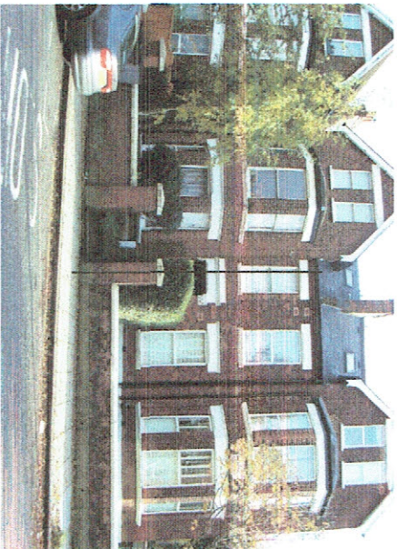
LOCATION WITH POLE Brick pier on the boundary line between 13 and 15 Minster Road with the proposed pole adjacent to centre line of pier.