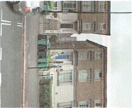
LOCATION WITHOUT POLE PARKING POLE IN FRONT OF 18 HILGROVE ROAD

A 5.5-metre high black pole at the rear of the footpath adjacent to the dwarf wall with wrought iron railings over, approx 1m to the left of the tree with a wire crossing Hilgrove Road to a matching pole opposite at the rear of the footpath in front of the line of junction between 16 + 18 Hilgrove Road. Remove existing parking poles to each side, refix parking signs at existing height and reinstate footpaths to match existing.