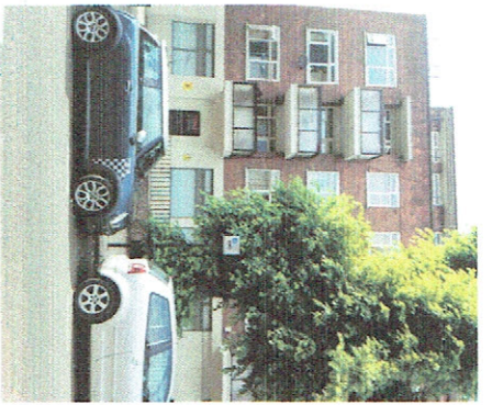
LOCATION WITHOUT POLE PARKING POLE IN FRONT OF 1 - 16 HILGROVE ROAD