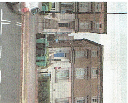
LOCATION WITH POLE PARKING POLE RELOCATED EXTENDED AT REAR OF FOOTPATH ON LINE OF JUNCTION OF 16/18 HILGROVE ROAD