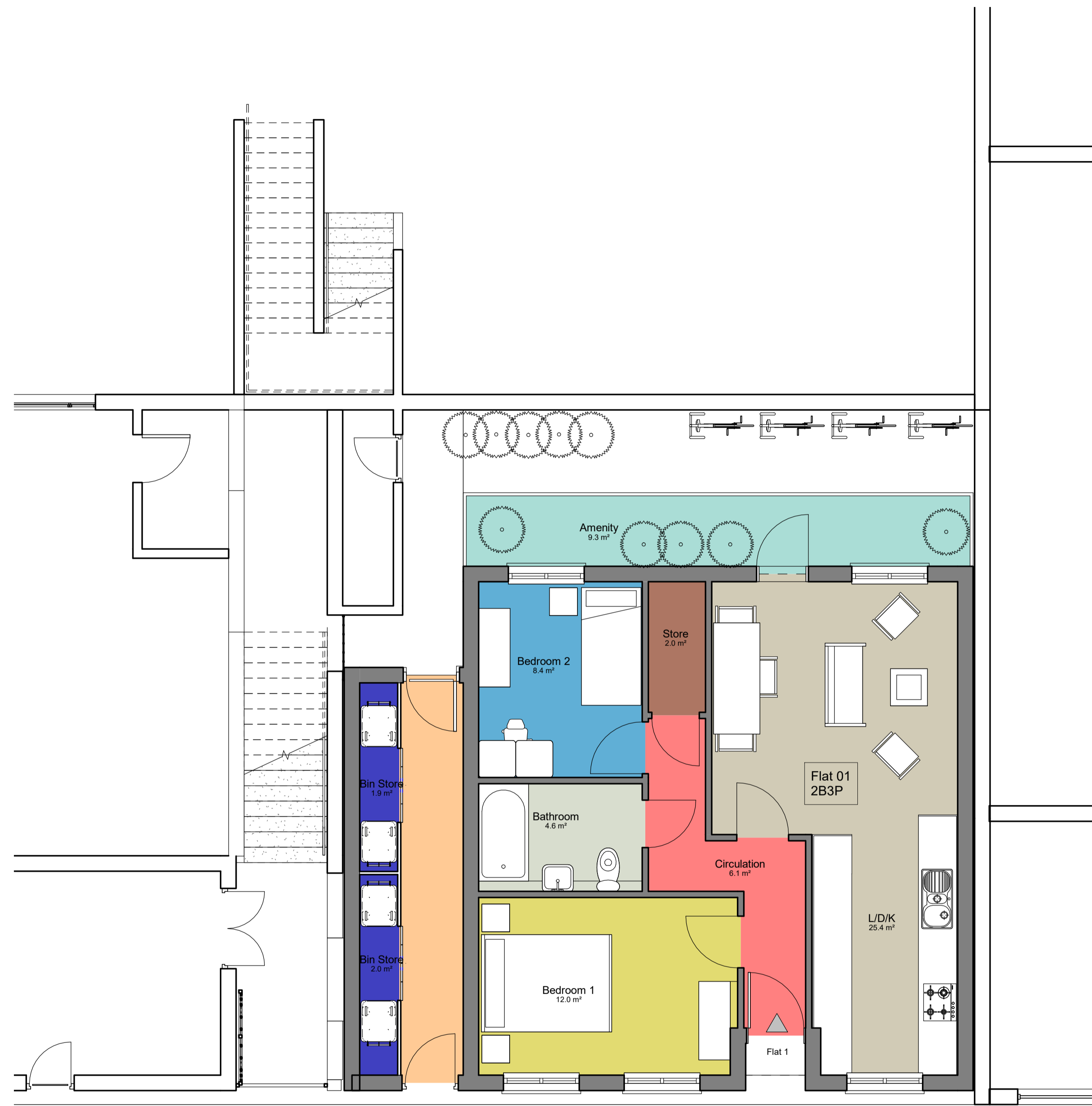
1 Proposed Ground Floor 1:50