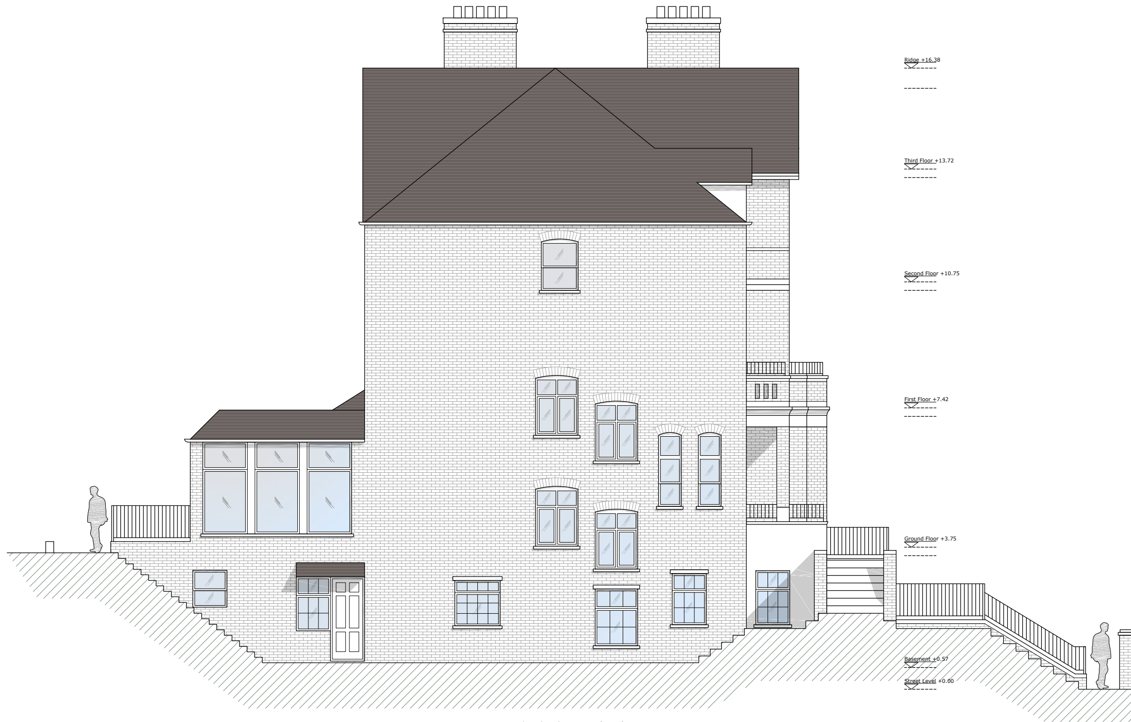
Proposed Side Elevation (LHS) Scale: 1/100 (A3 Sheet)

A-25-04-'18- Added finishes materials specification B-11-06-'18- Conservatory Depth Reduced