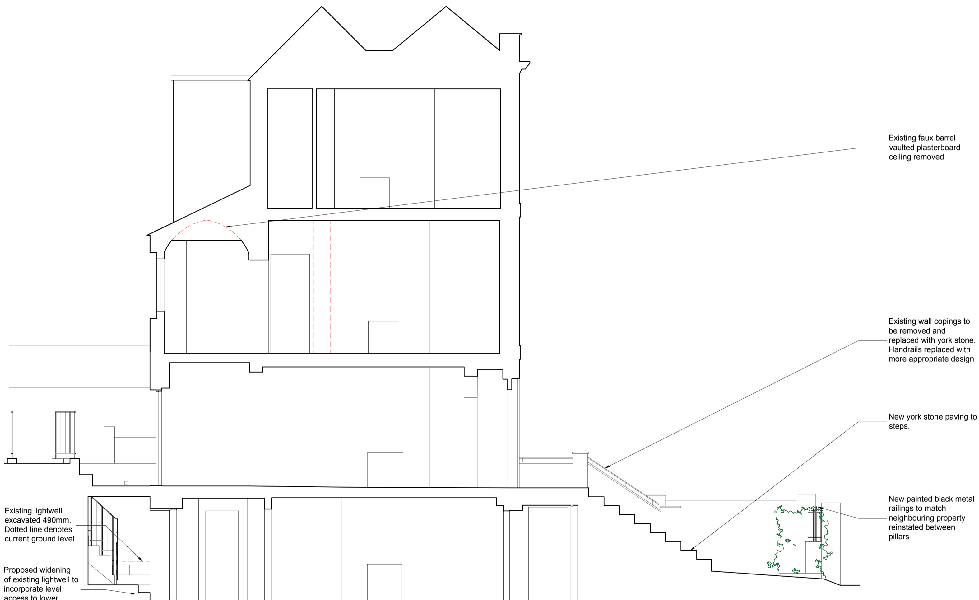
Existing Section A-A