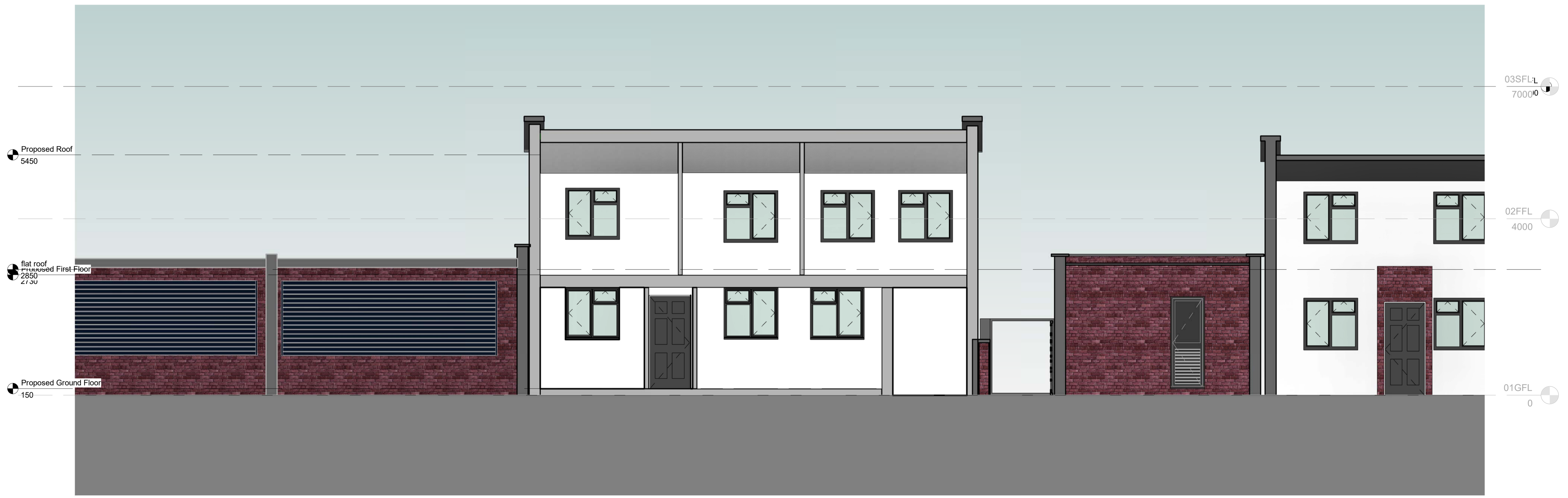
2 Section D-D 1:50

NOTES: 1. THIS DRAWING IS COPYRIGHT AND MUST NOT BE REPRODUCED IN WHOLE OR IN PART WITHOUT WRITTEN PERMISSION 2. THIS DRAWING MUST NOT BE SCALED 3. REFER TO FIGURED DIMENSIONS ONLY. CHECK FOR PURPOSE OF CONSIDERATION UNDER PLANNING LEGISLATION 4. ALL DIMENSIONS AND LEVELS TO BE CHECKED ON SITE. CLIENT TO BE NOTIFIED OF ANY DISCREPANCIES 5. ALL STRUCTURAL DETAILS TO BE CHECKED AGAINST THE STRUCTURAL ENGINEERS DRAWINGS 6. THIS DRAWING TO BE READ IN CONJUNCTION WITH THE OTHER RELEVANT PROJECT DRAWINGS AND IN ADDITION WITH STRUCTURAL, M & E ENGINEERS, APPROVED SUB-CONTRACTORS DRAWINGS AND CURRENT INSTRUCTIONS 7. ALL WORK TO BE UNDERTAKEN WITH THE REQUIREMENTS OF THE CURRENT BUILDING AND WATER REGULATIONS 8. DIMENSIONS USE AS FIGURED DIMENSIONS ONLY. ALL TO BE CHECKED ON SITE PRIOR TO CONSTRUCTION 9. CONTRACTOR SHALL OBTAIN REQUIRED PERMITS FROM ALL AGENCIES AND PAY ALL FEES PRIOR TO COMMENCEMENT OF ANY WORK