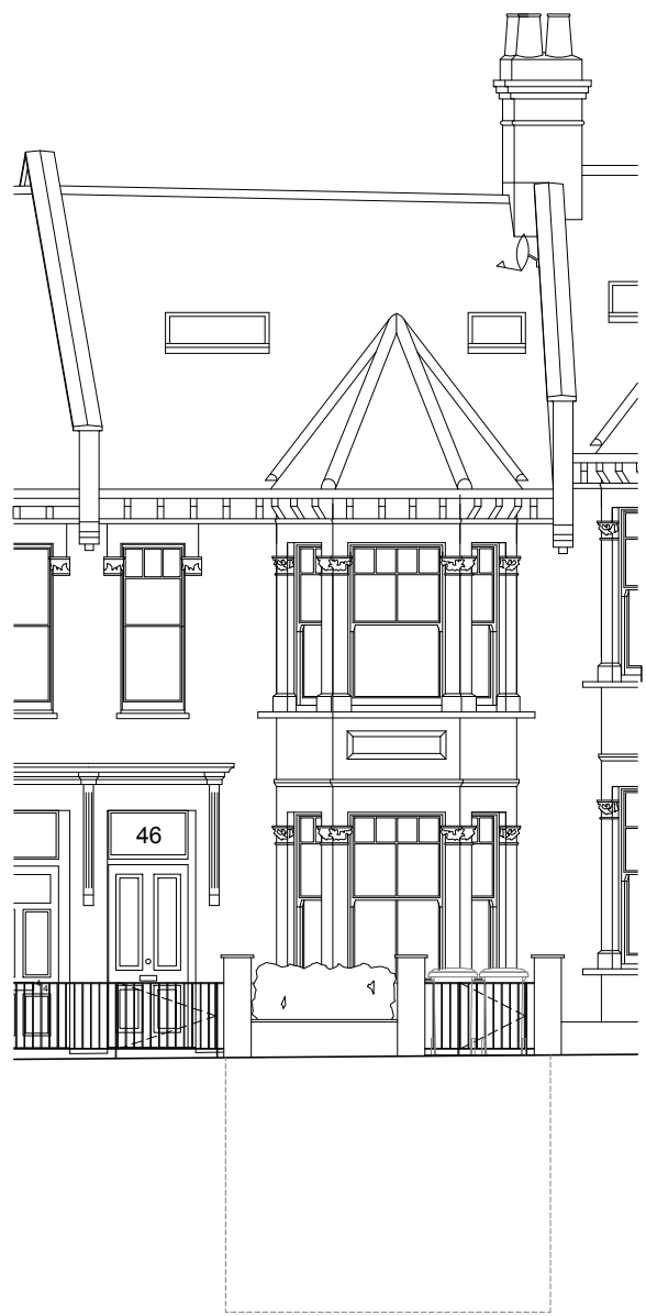
STREET ELEVATION @ 1:100