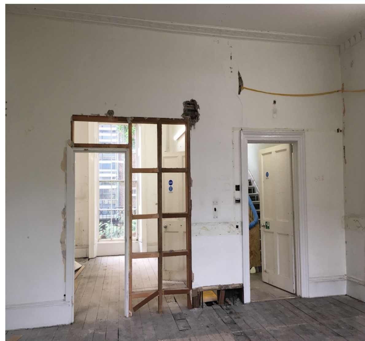
IMG_6968 First Floor TOR32-101-Seminar Room