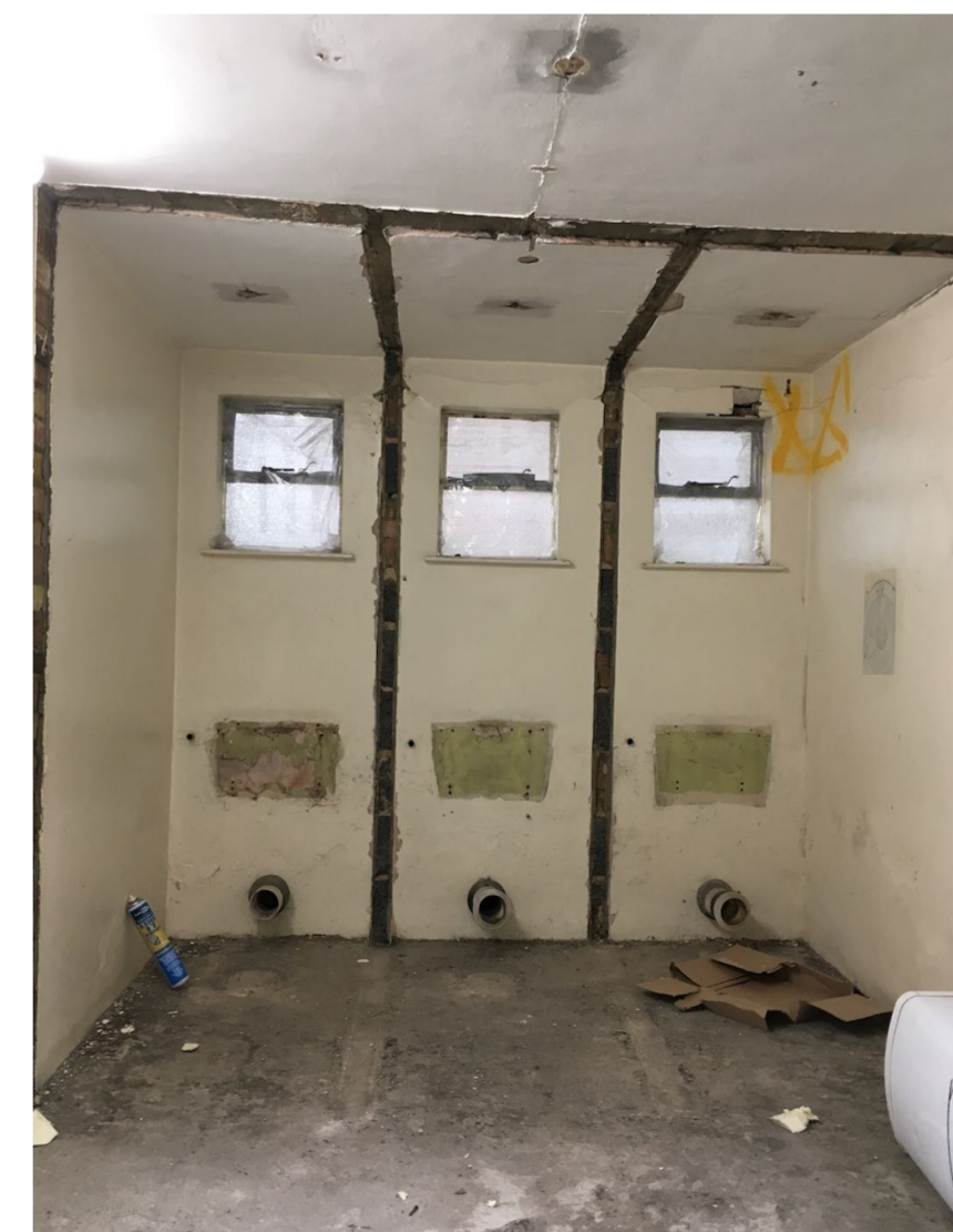
IMG_6963 First Floor TOR103-Toilet facilities