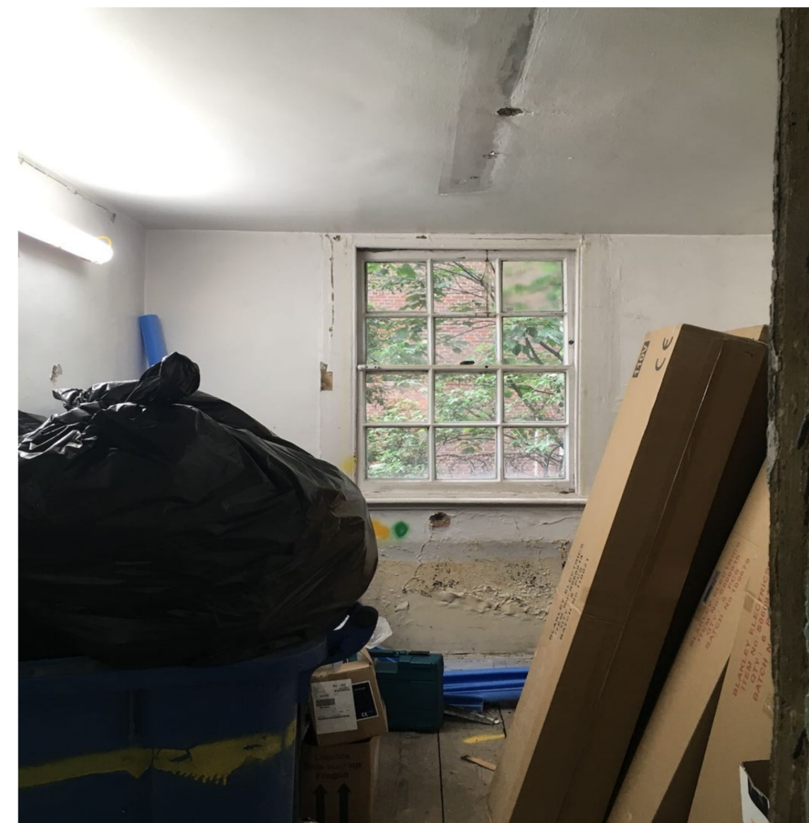
IMG_6956 Ground Floor 00-32-02-Toilet facilities