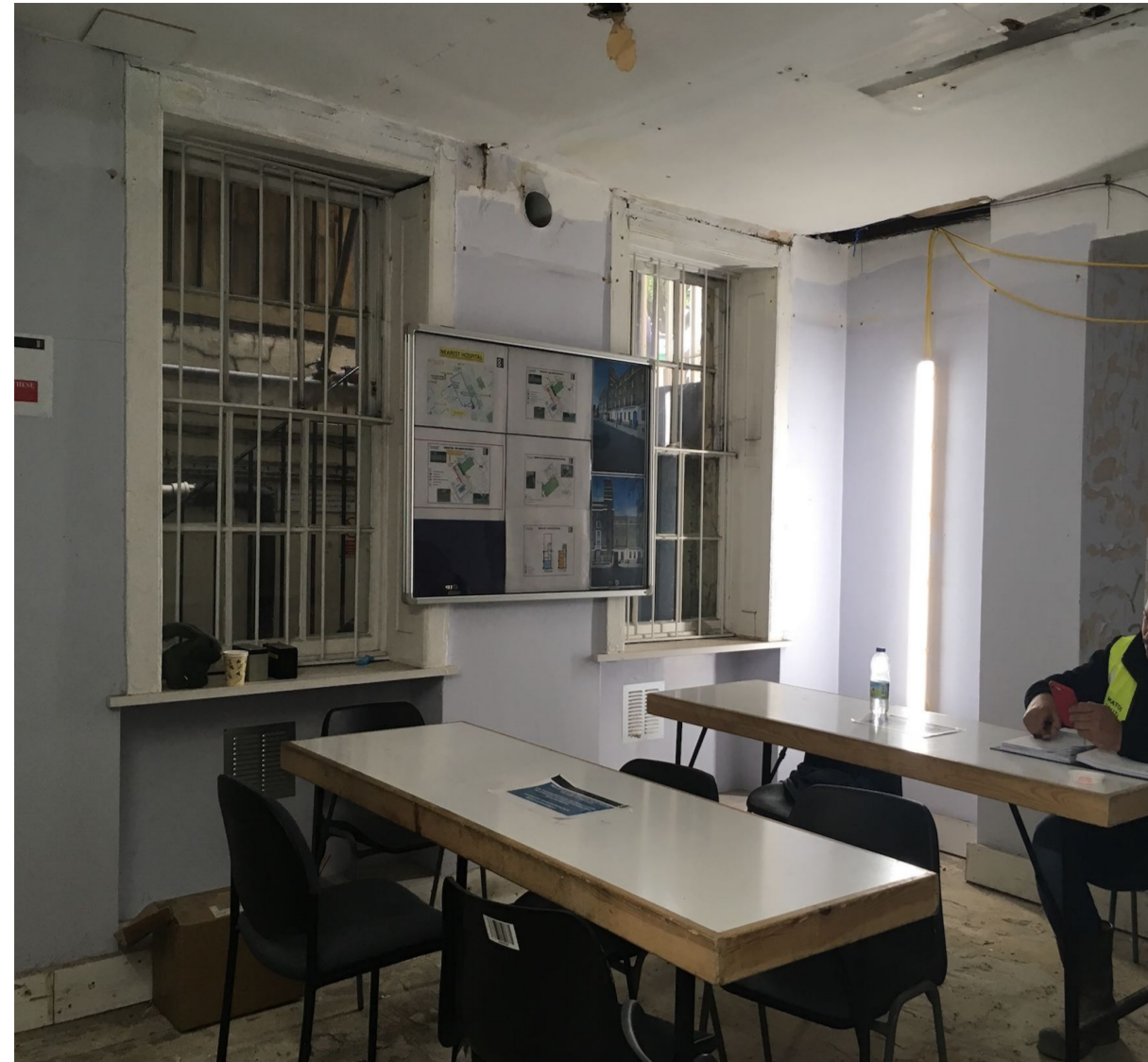
IMG_6959 Basement TOR32-B1-Tech Room