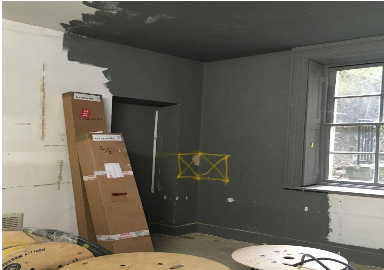
IMG_6960 Basement TOR32-B3-Office