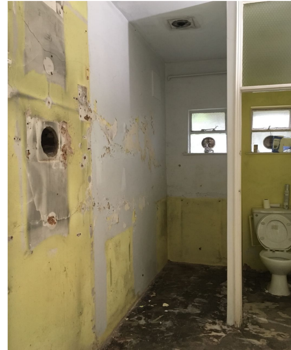
IMG_6961 Basement B-32-02-Toilet facilities