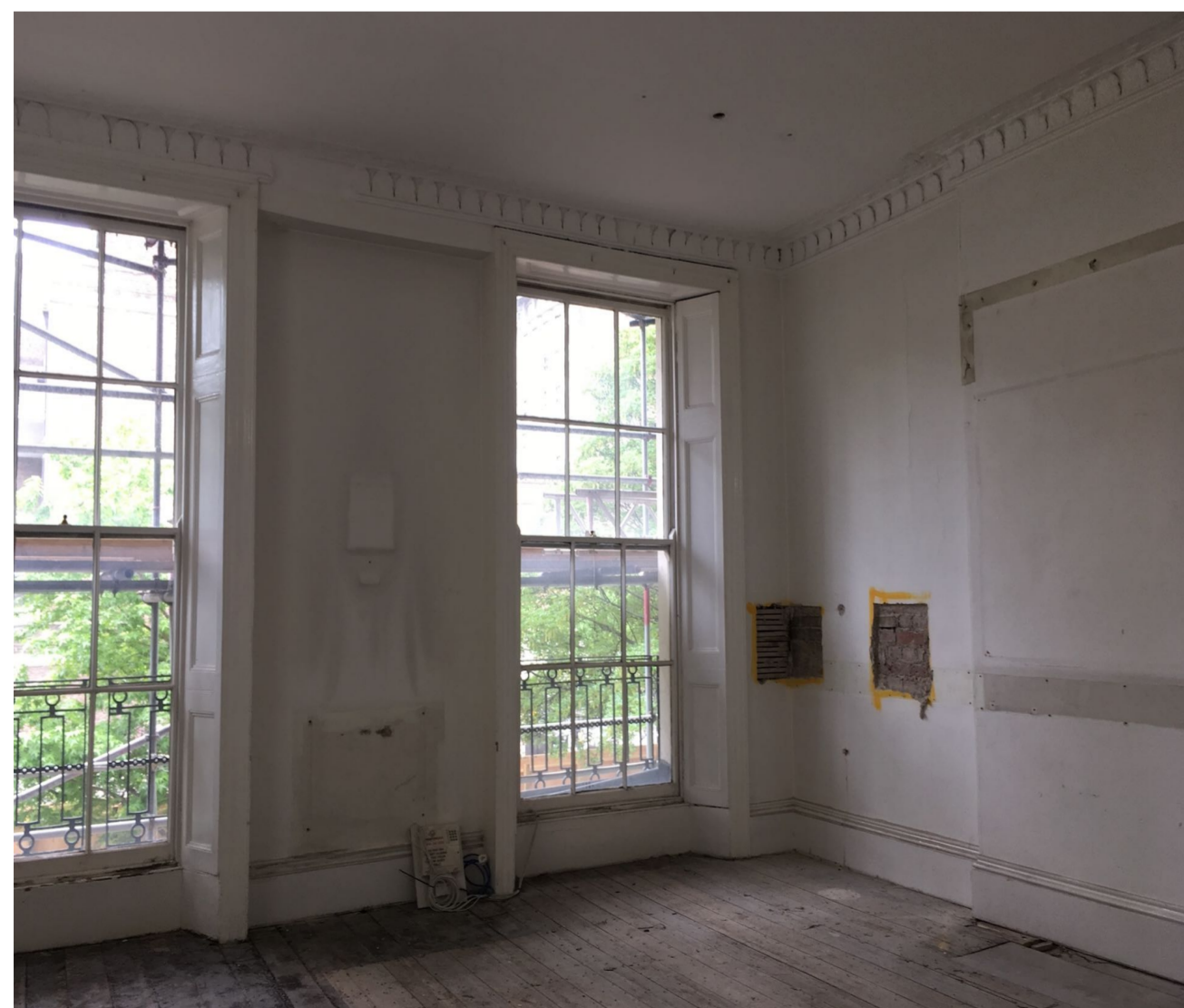
IMG_6966 First Floor TOR32-101-Seminar Room