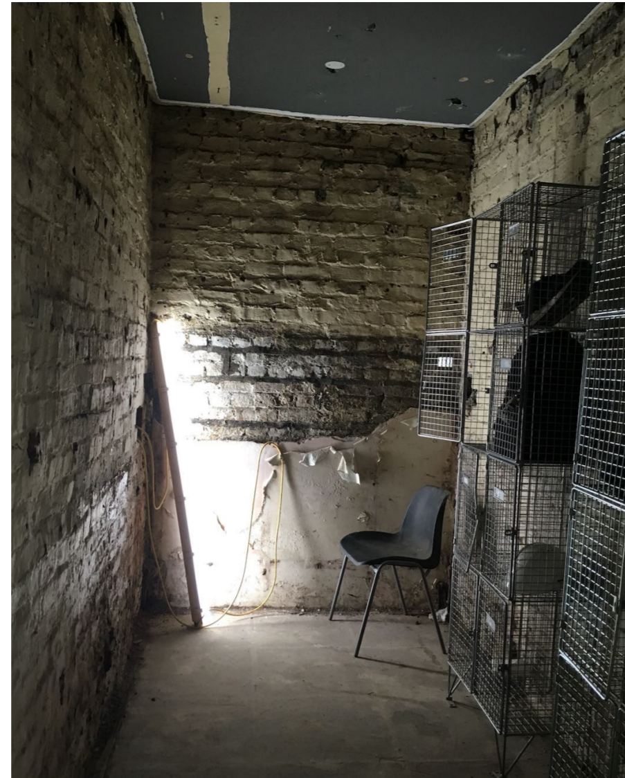
IMG_6958 Basement TOR32-B2-Comms Room