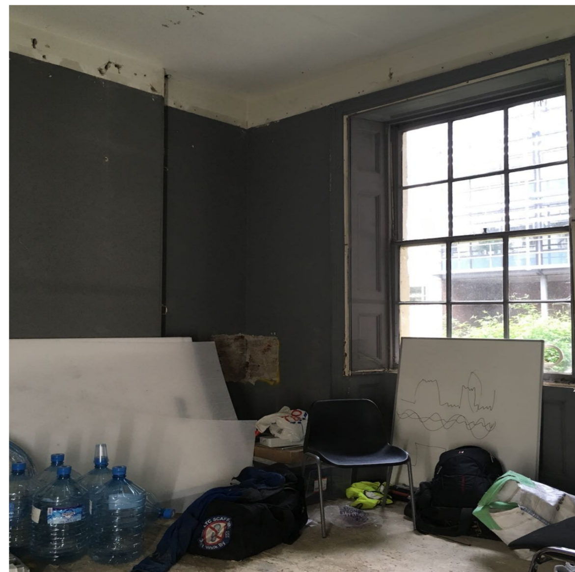
IMG_6954 Ground Floor TOR32-G2-Office