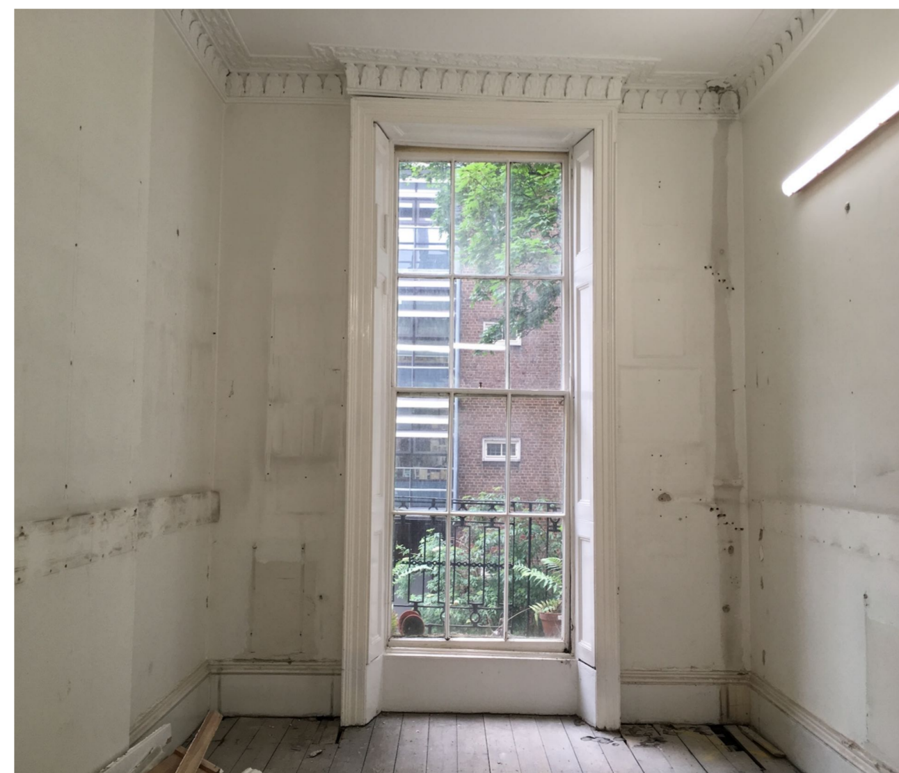
IMG_6969 First Floor 01-32-02A-Kitchenette