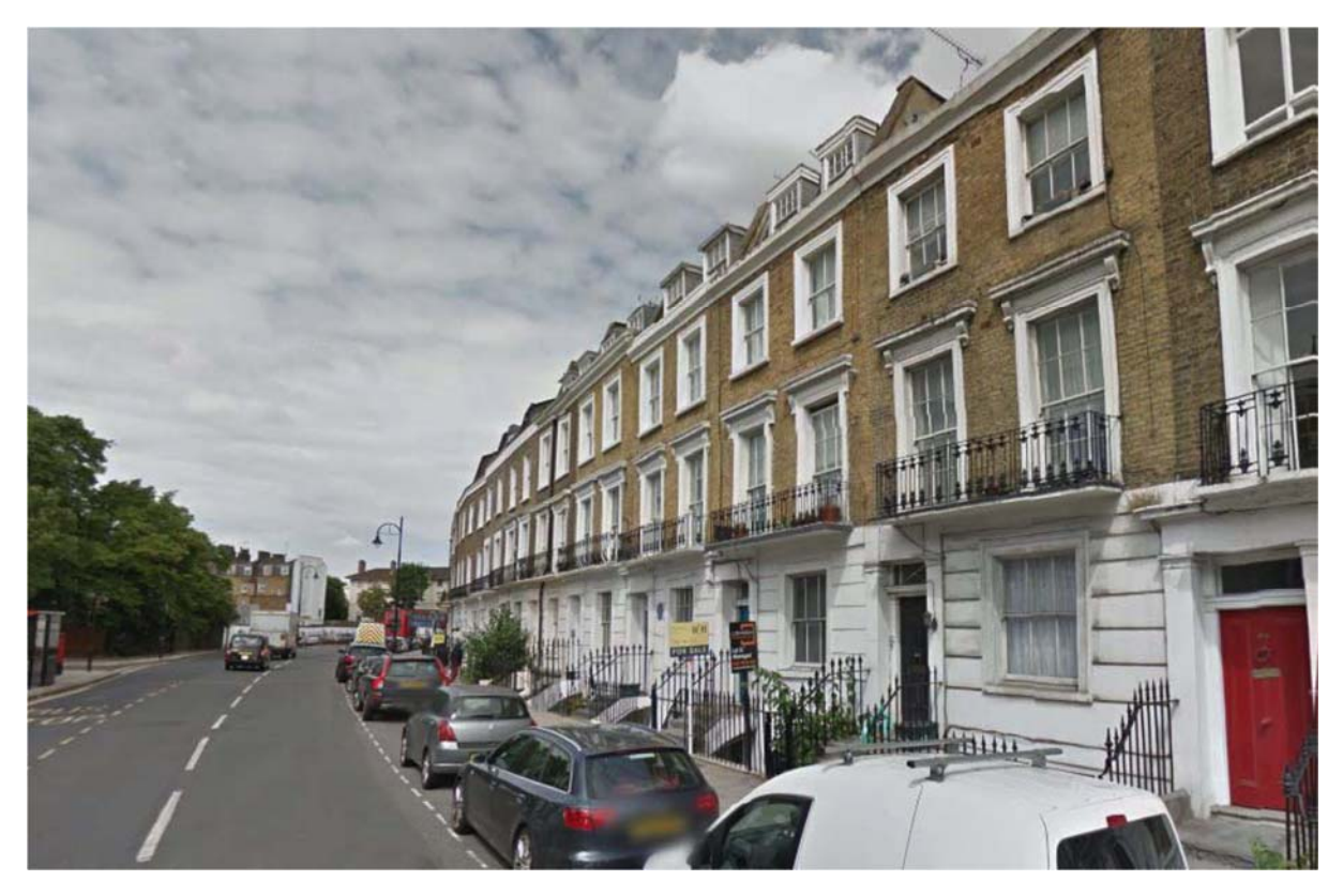
Photograph of 52 Delancey Street from street level

The design will follow design guidance to replicate the character and design of the property and surroundings. Windows, doors and materials will match the existing building.