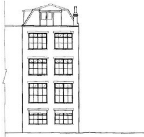
SIDE ELEVATION AS EXISTING