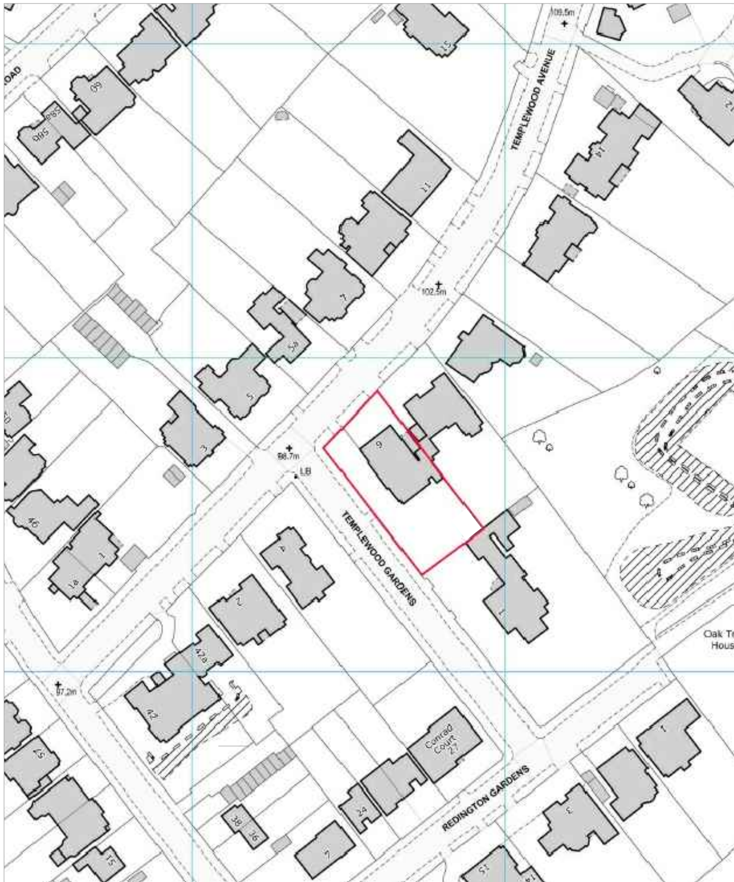
Location Plan Scale 1:1250 @ A3