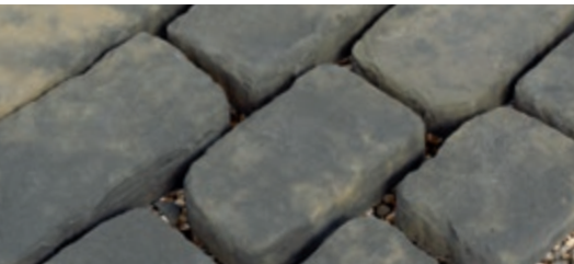
Heritage Cobblestones, Old Yorkstone (OY)