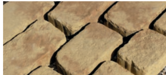
Heritage Cobblestones, Yorkstone (Y)