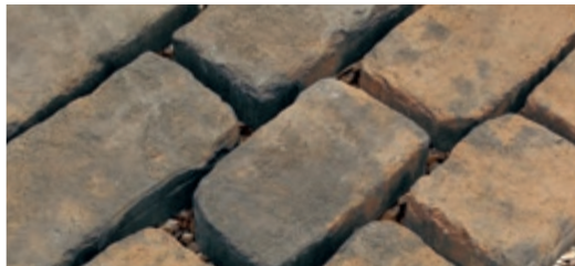
Heritage Cobblestones, Calder Brown (CB)