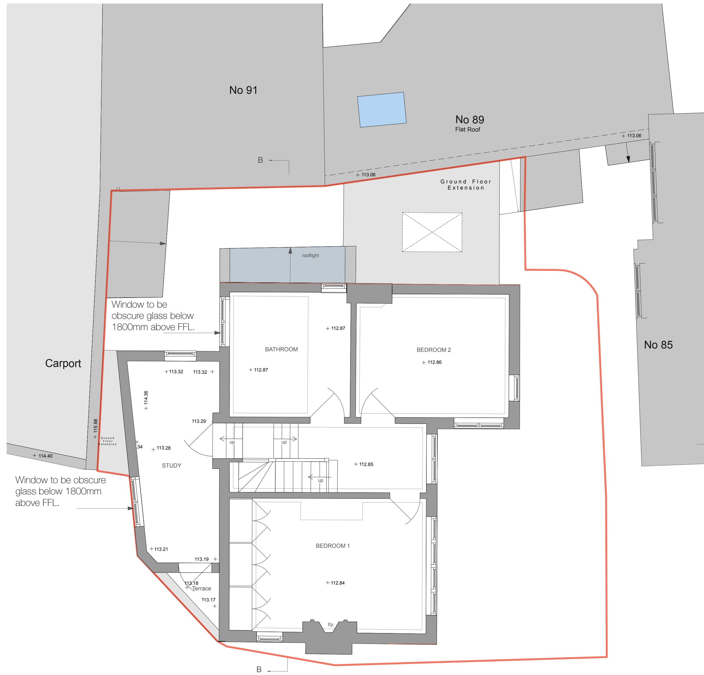
Proposed First Floor Plan 1:50 @ A1