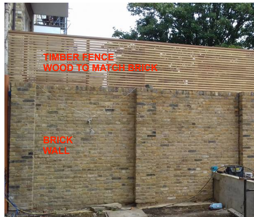
(4) MATERIAL SAMPLES

REV A Fence to rear of 14 St. Martins Lane omitted