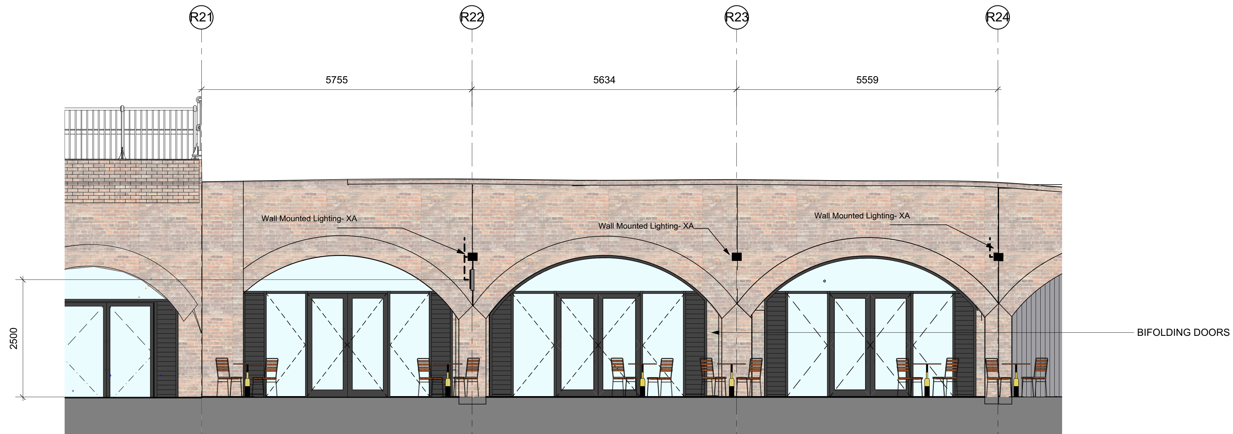
1 Proposed External Elevation - Wine Bar Arches 1:50