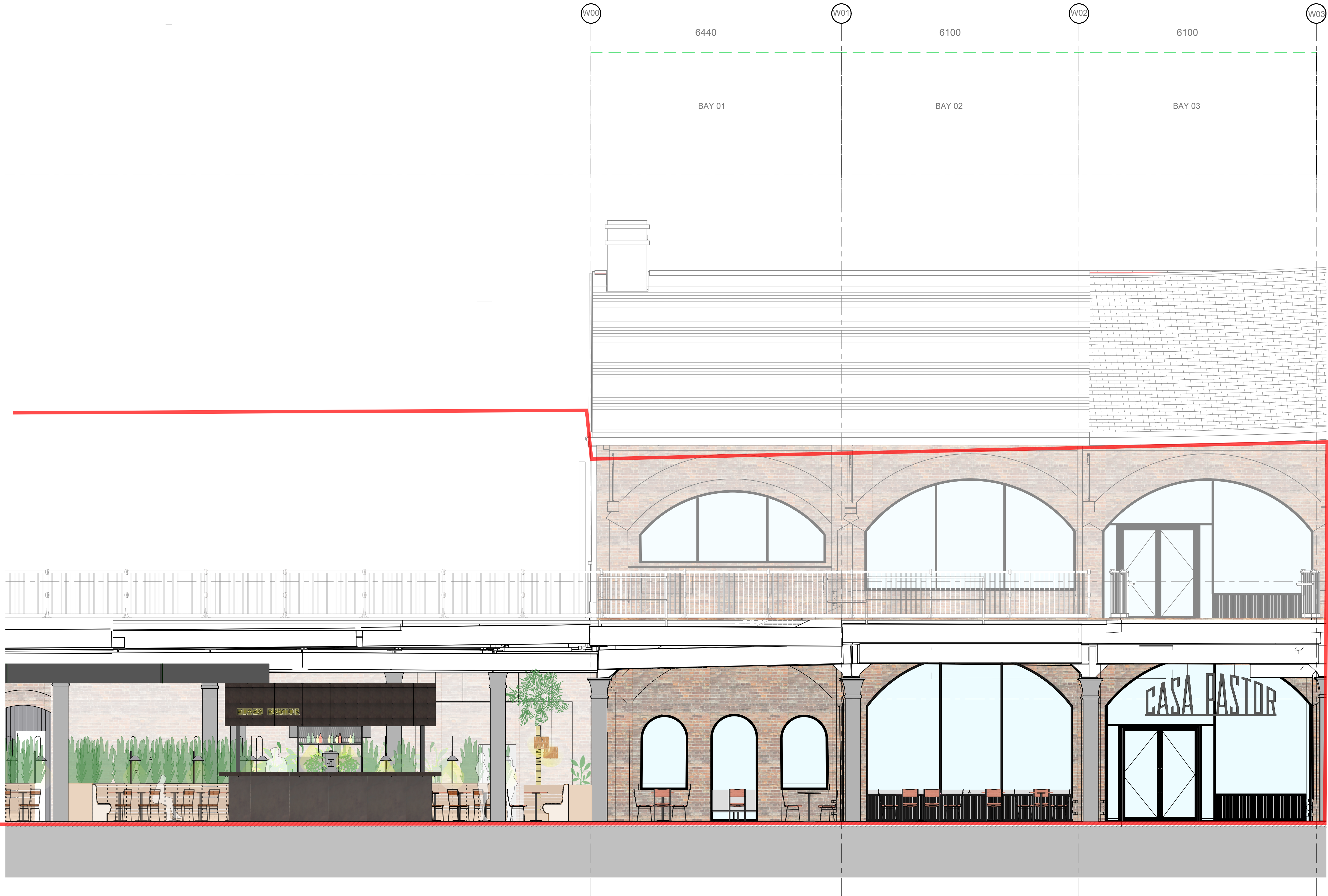
1 Elevation AA 1:50