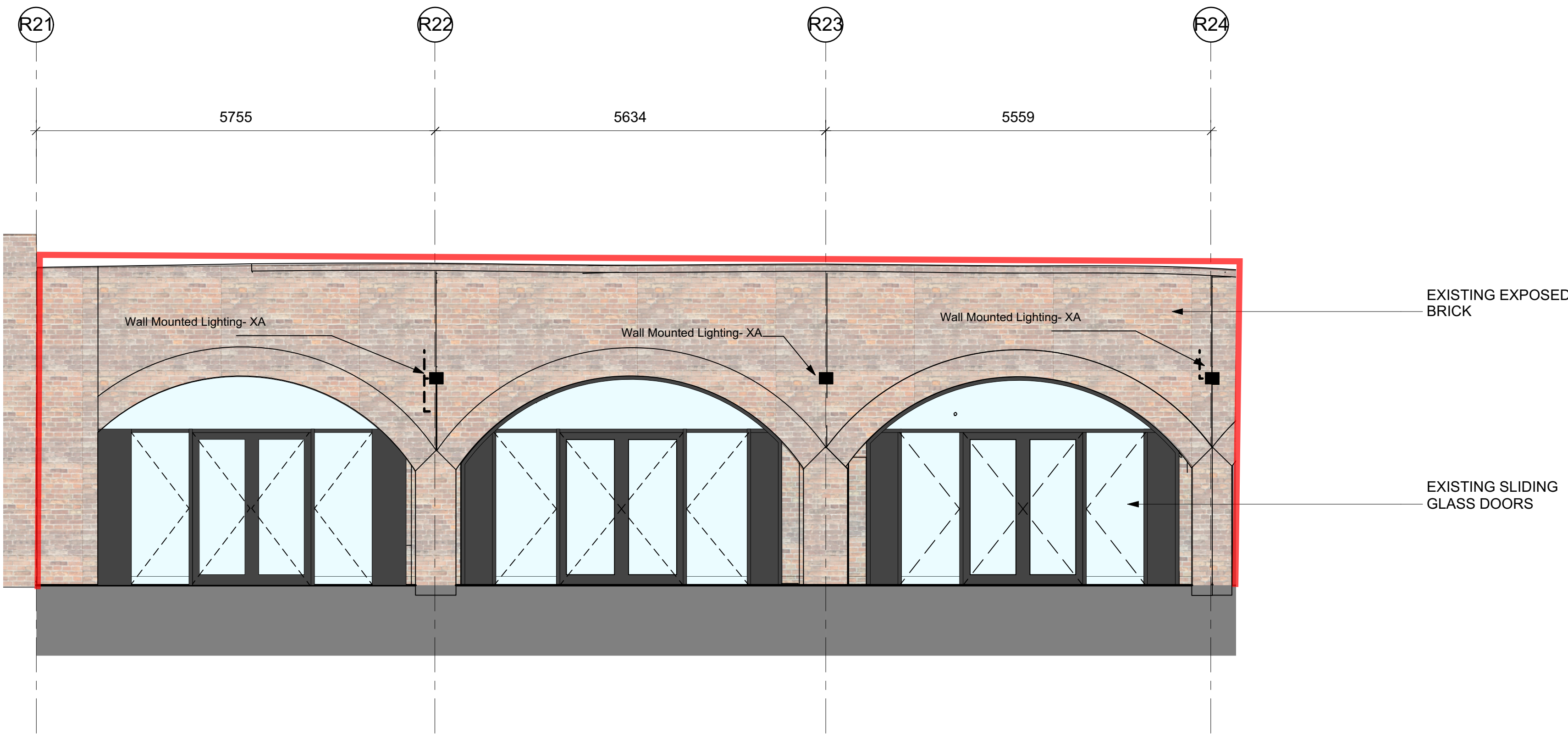
1 Existing Elevation AA Bagley Arches 1:50

44 20 7221 1237 hello@michaelisboyd.com michaelisboyd.com