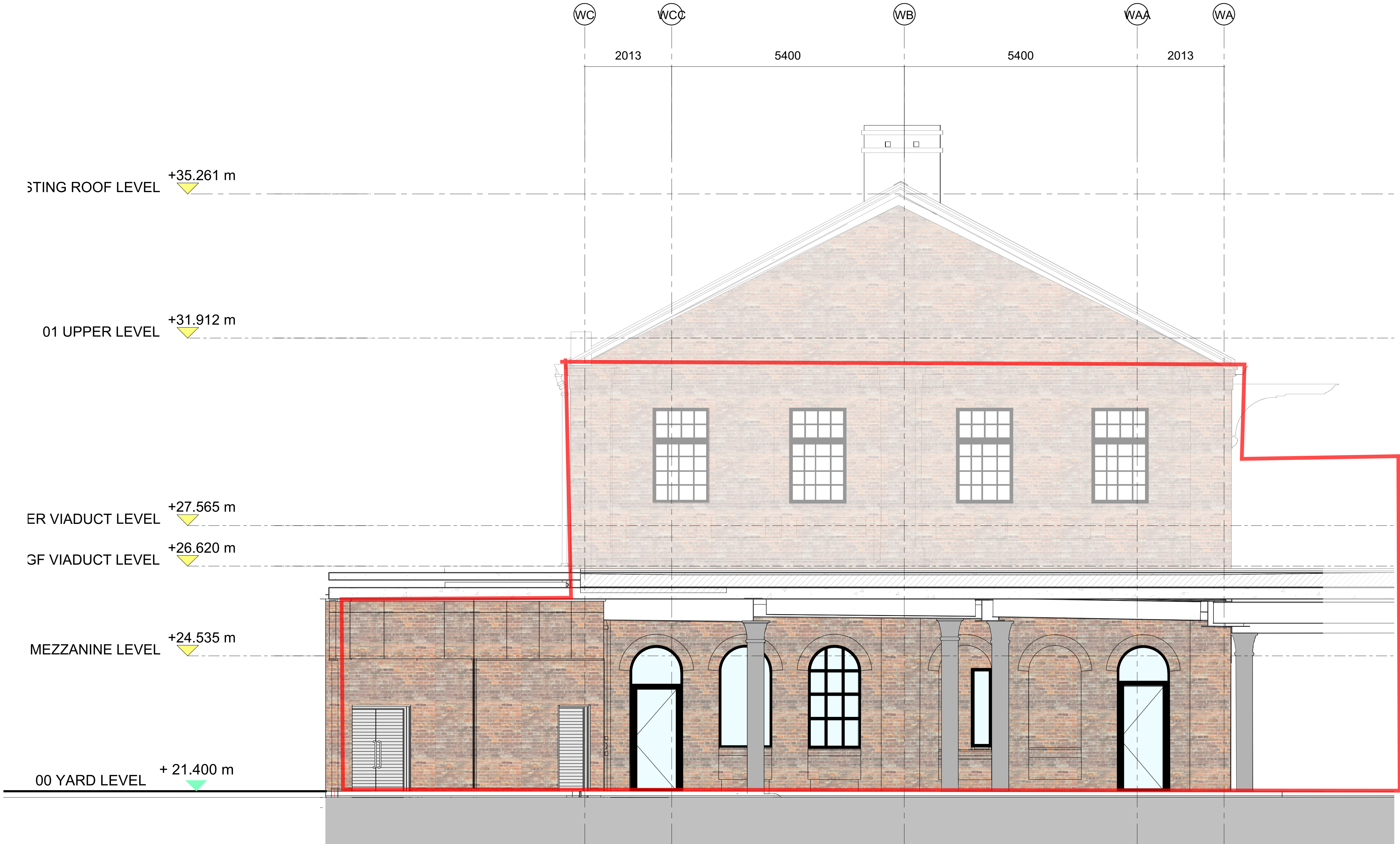
2 Existing Elevation B 1:50

44 20 7221 1237 hello@michaelisboyd.com michaelisboyd.com