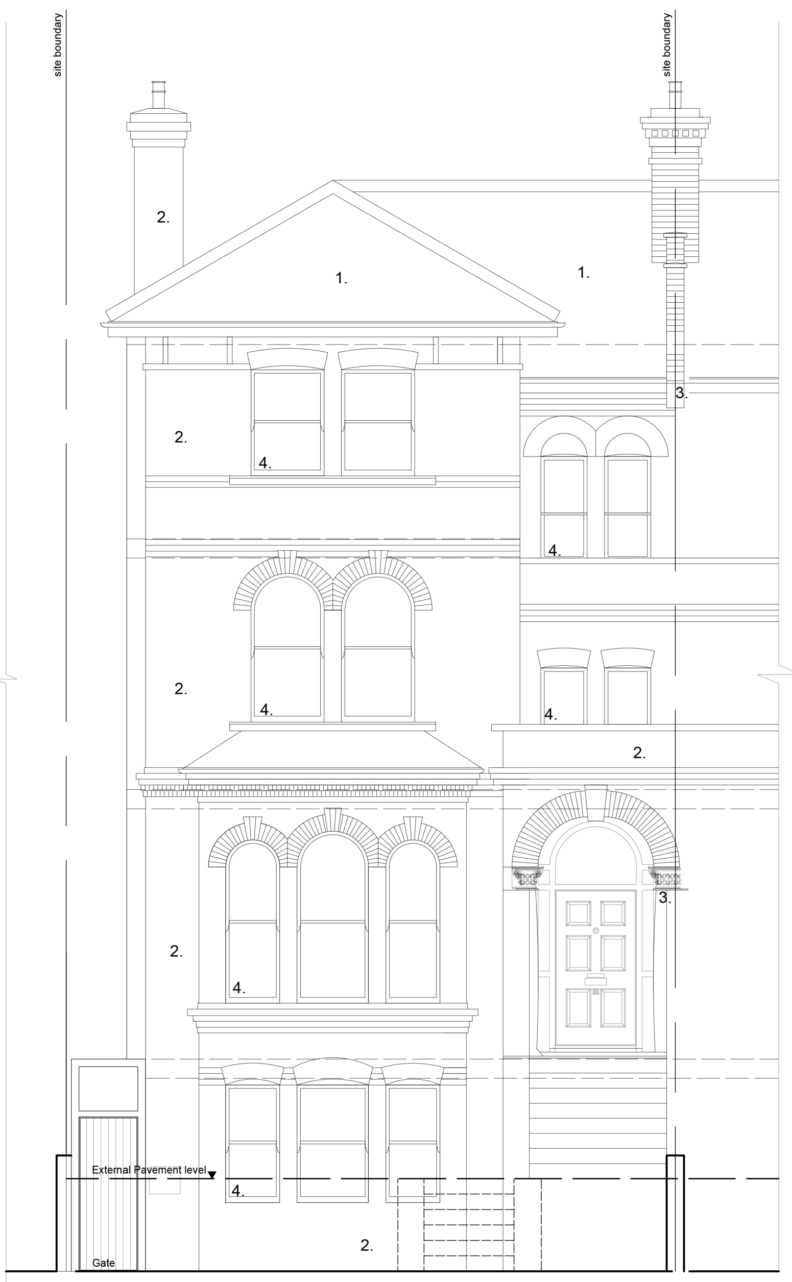
EXISTING & PROPOSED FRONT ELEVATION (NO CHANGE)