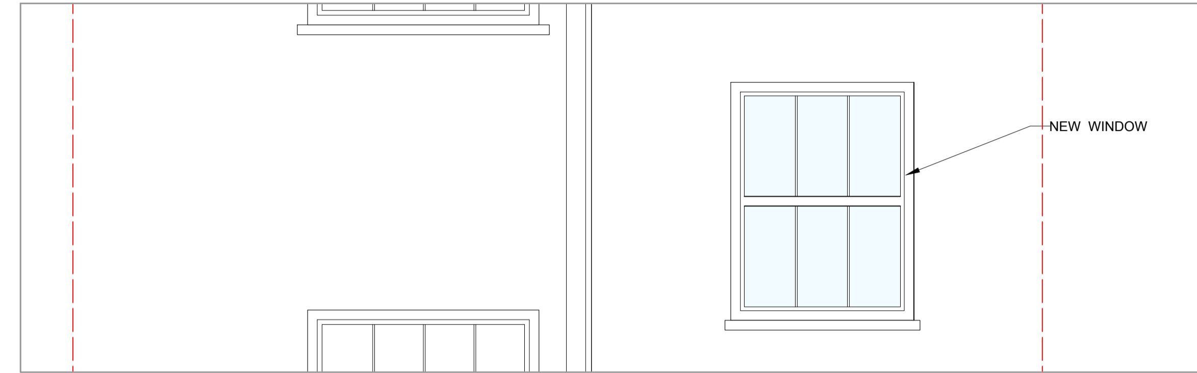
REAR ELEVATION DETAILS scale 1:20