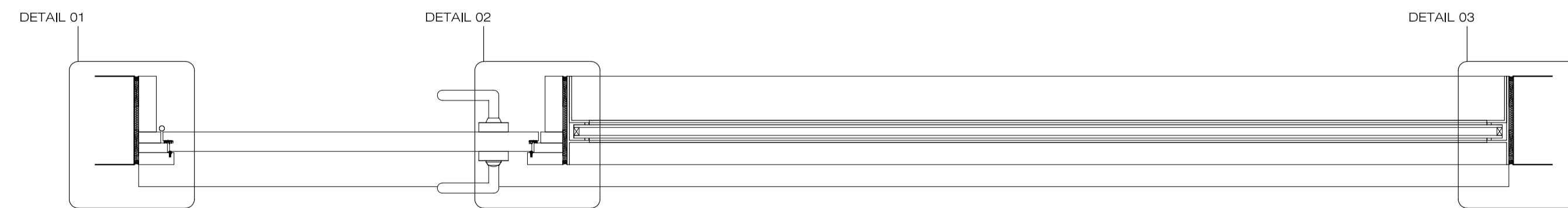
02 PROPOSED REAR GROUND FLOOR PLAN SECTION SCALE 1:10