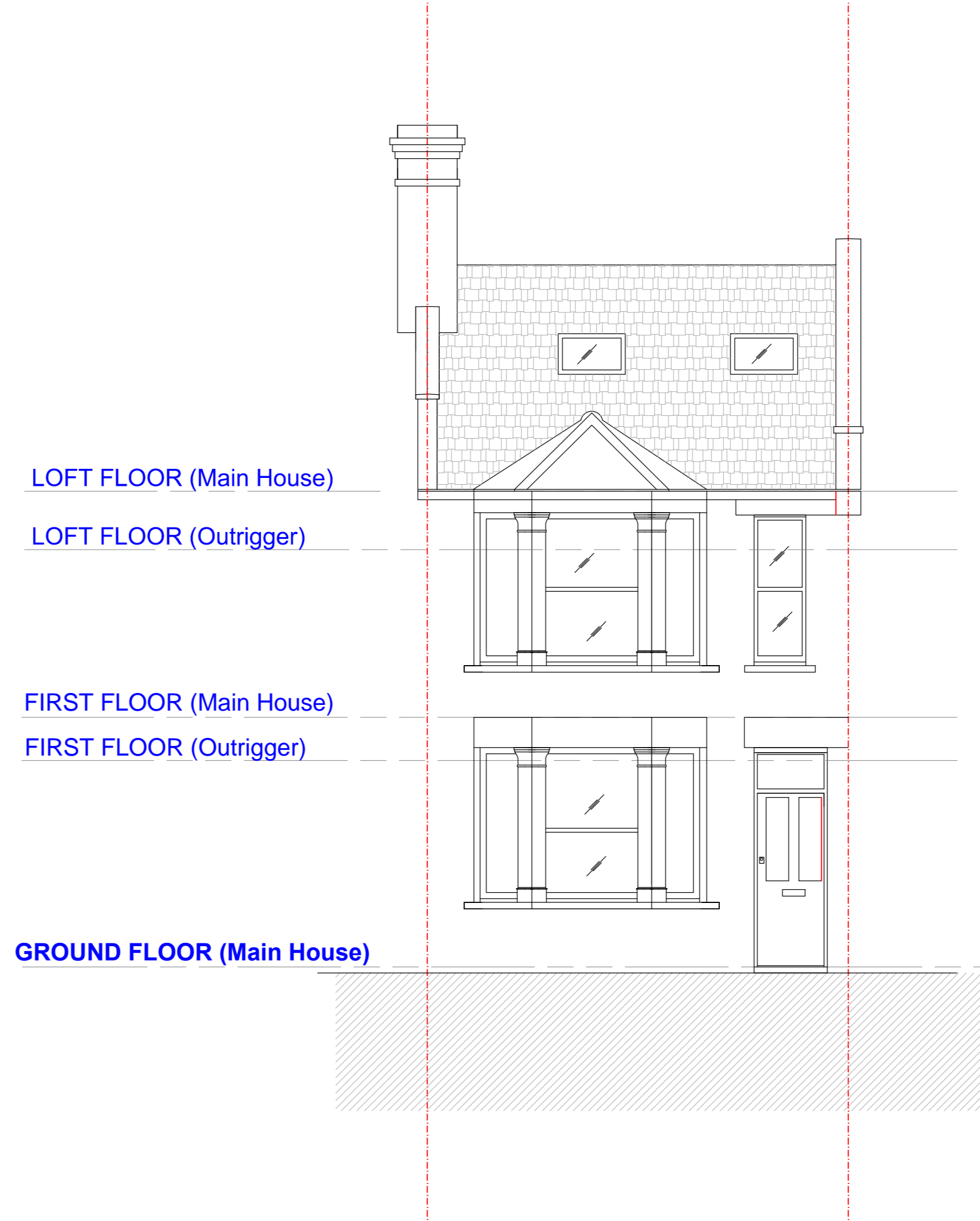
FRONT ELEVATION - PROPOSED