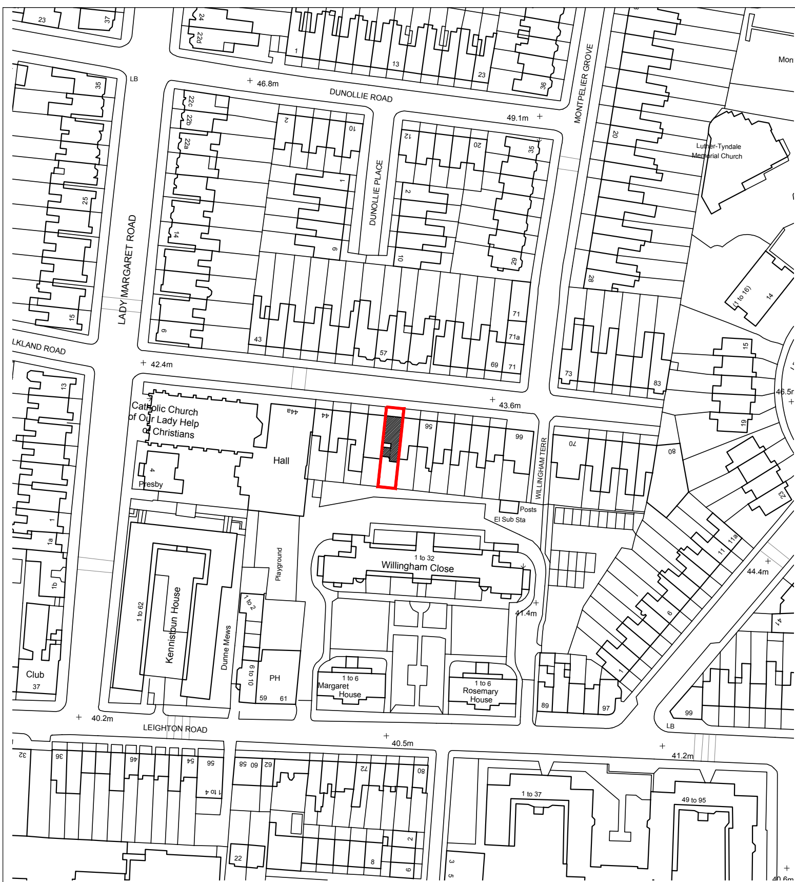
EXISTING Location Plan SCALE 1:1250@A3 LP-02