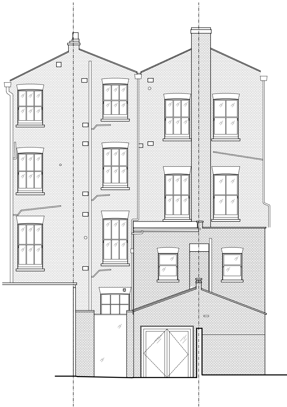
PROPOSED Rear Elevation SCALE 1:100@A3