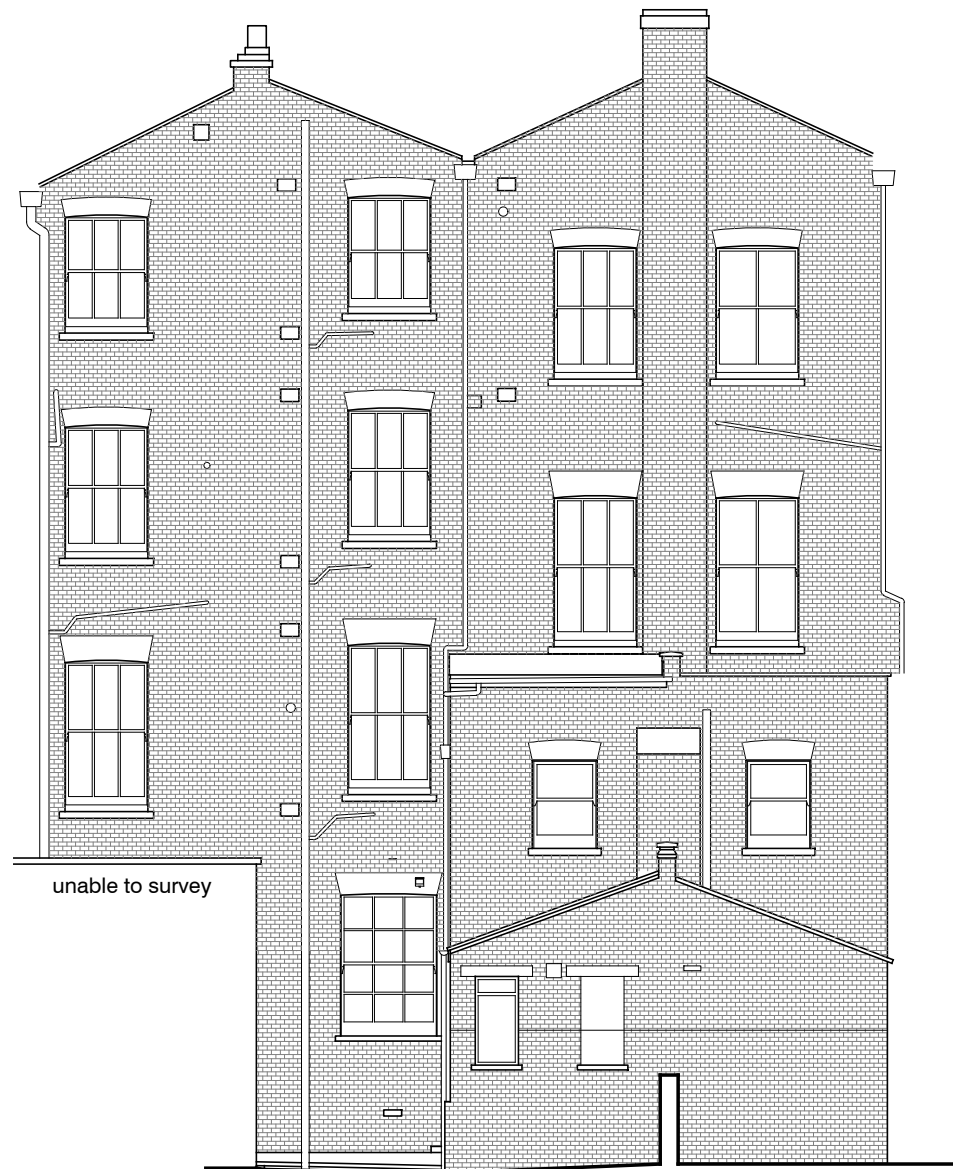
EXISTING Rear Elevation SCALE 1:100@A3