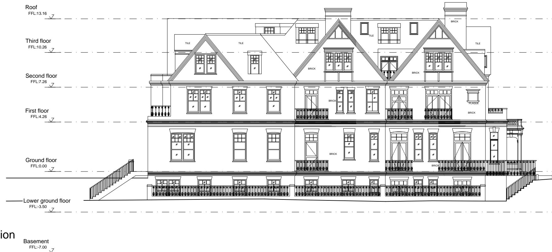
Proposed South street elevation Scale 1:200@A3