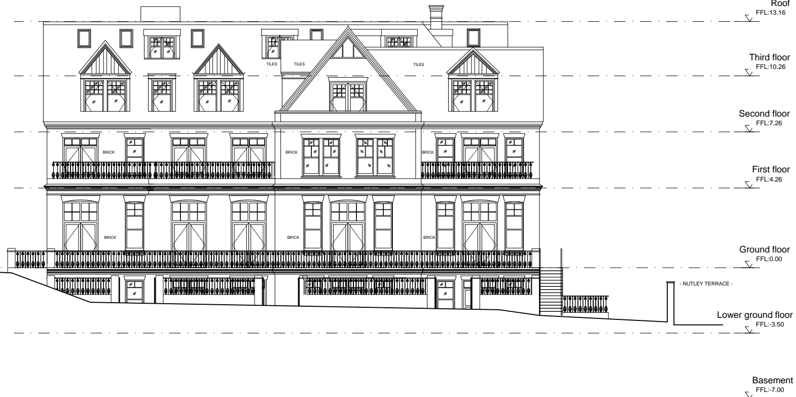
Proposed West street elevation Scale 1:200@A3