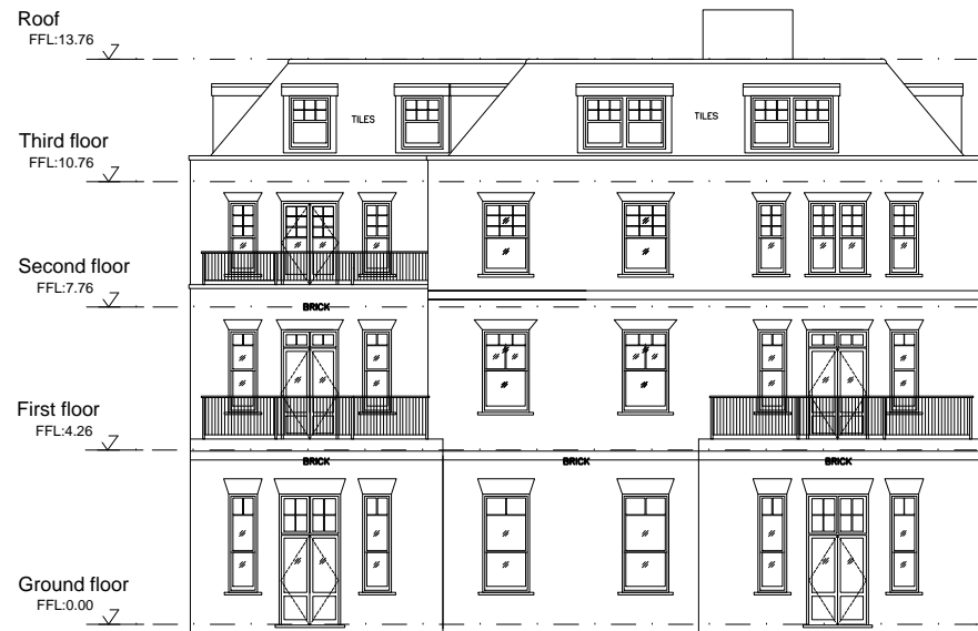
CONSented SCHEME ELEVATION 2017/4654/P