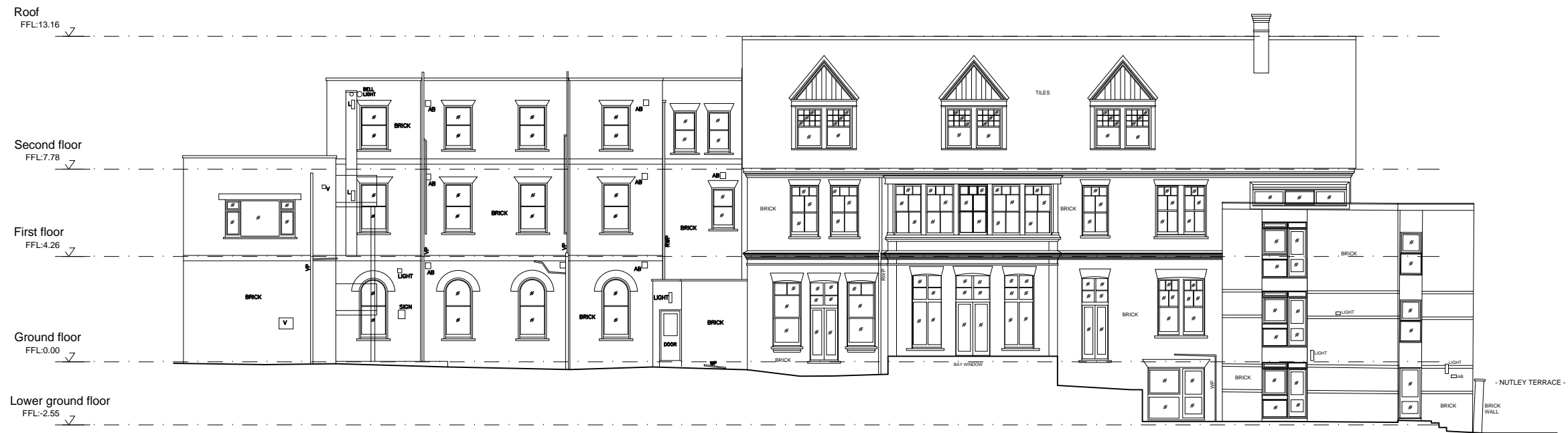
Existing West elevation Scale 1:200@A3