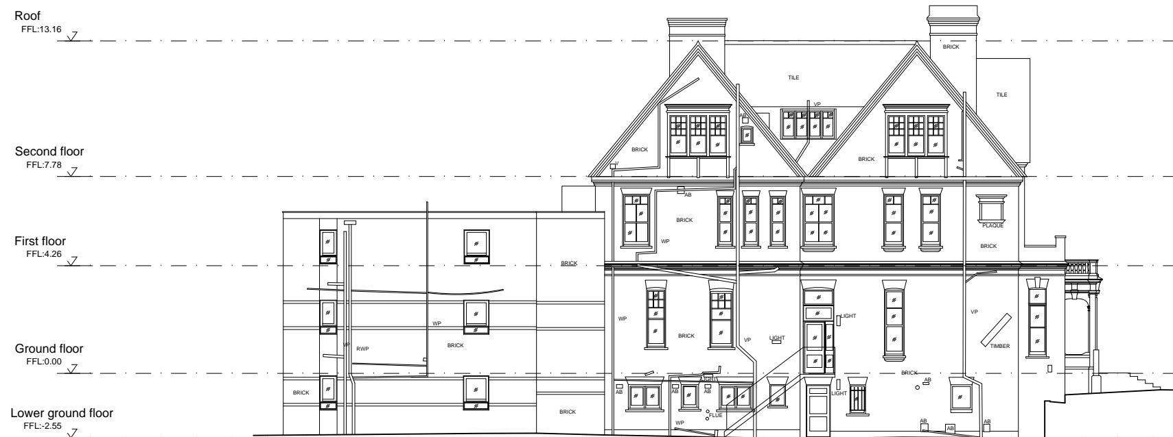
Existing South elevation Scale 1:200@A3