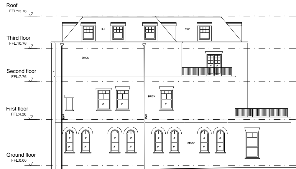
CONSENTED SCHEME ELEVATION 2017/4654/P