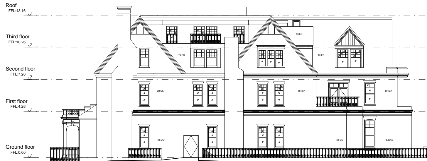
Proposed North street elevation Scale 1:200@A3