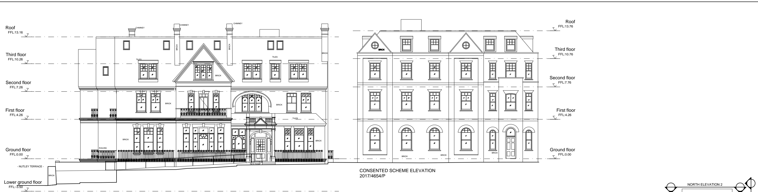
Proposed East street elevation Scale 1:200@A3