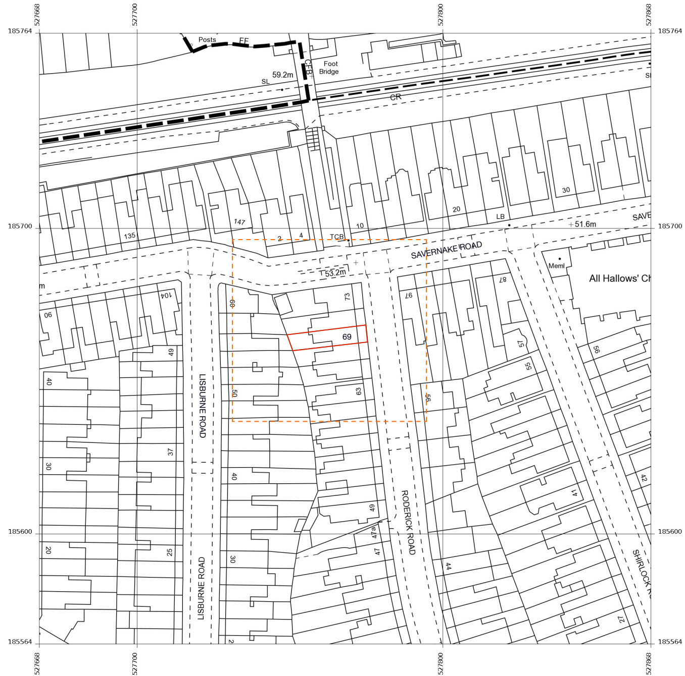
OS PLAN Scale 1:1250@A3