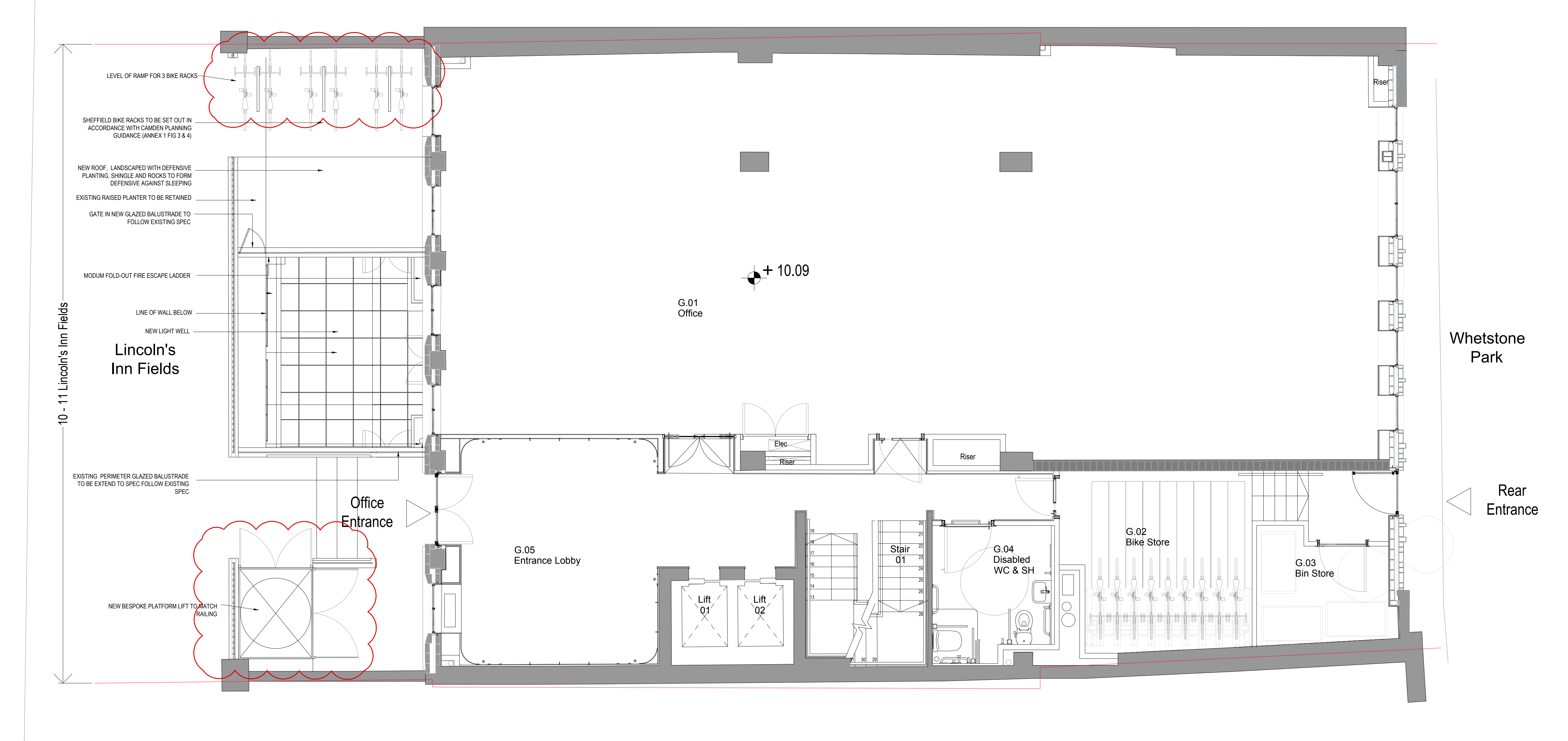
12-14 Lincoln's Inn Fields