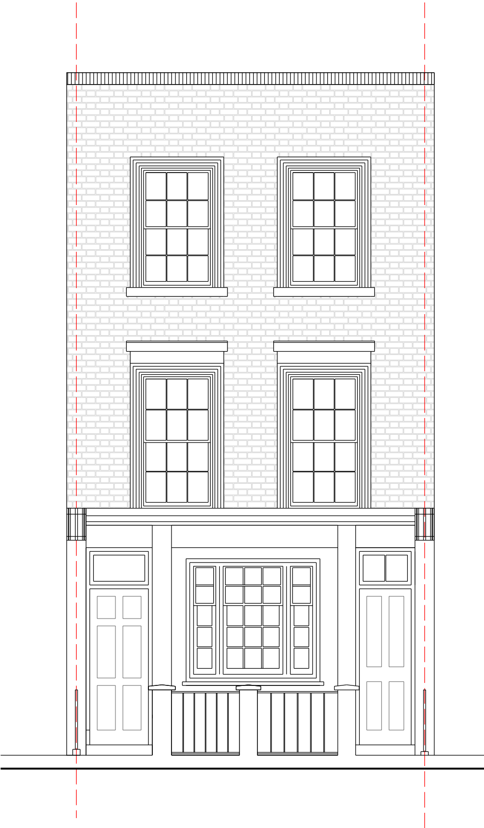
EXISTING STREET ELEVATION