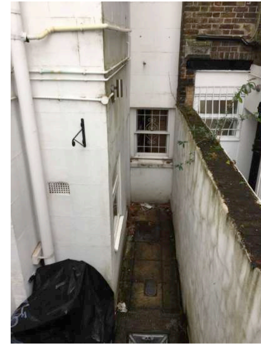
4. Side entrance