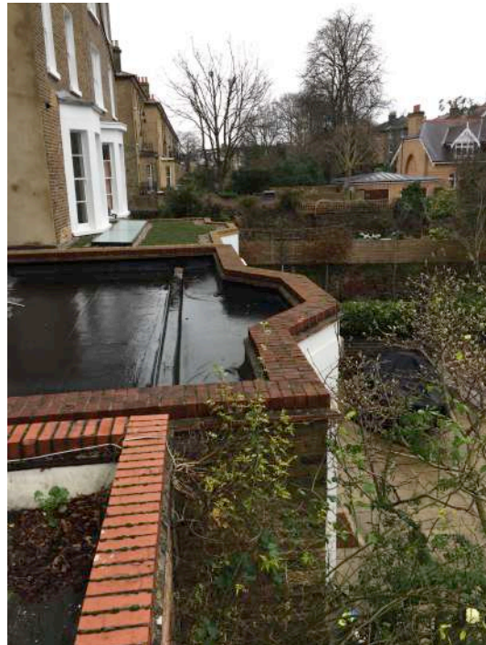
5. Rear part of the house showing neighbour's building line