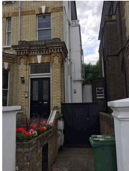
6. Front elevation. The entrance steps will be moved forward to the street, as in the following image that shows No. 117 King Henry's Road