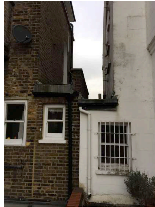
3. Front wall to side of entrance: to be moved forward and raised up to match the neighbour's alignment and height