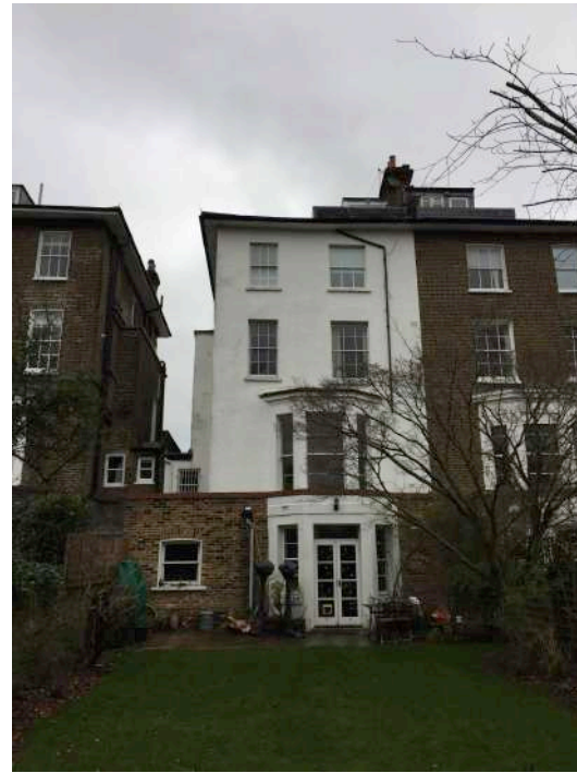
2. Rear Elevation. The wall at lower ground floor will be moved forward to match the neighbour's alignment and the bay enlarged