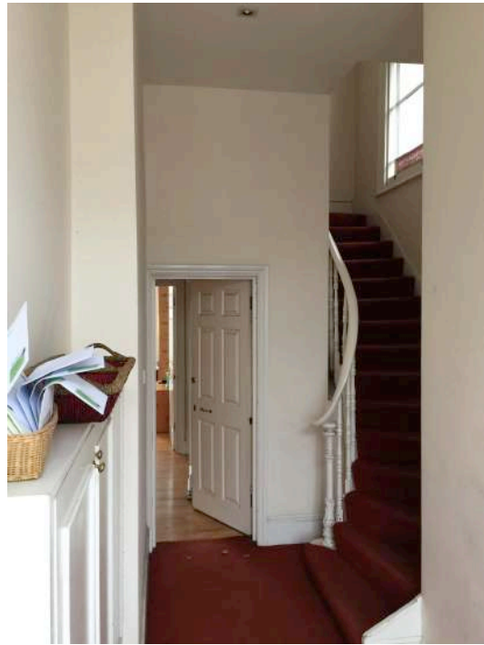
1. Entrance Hallway