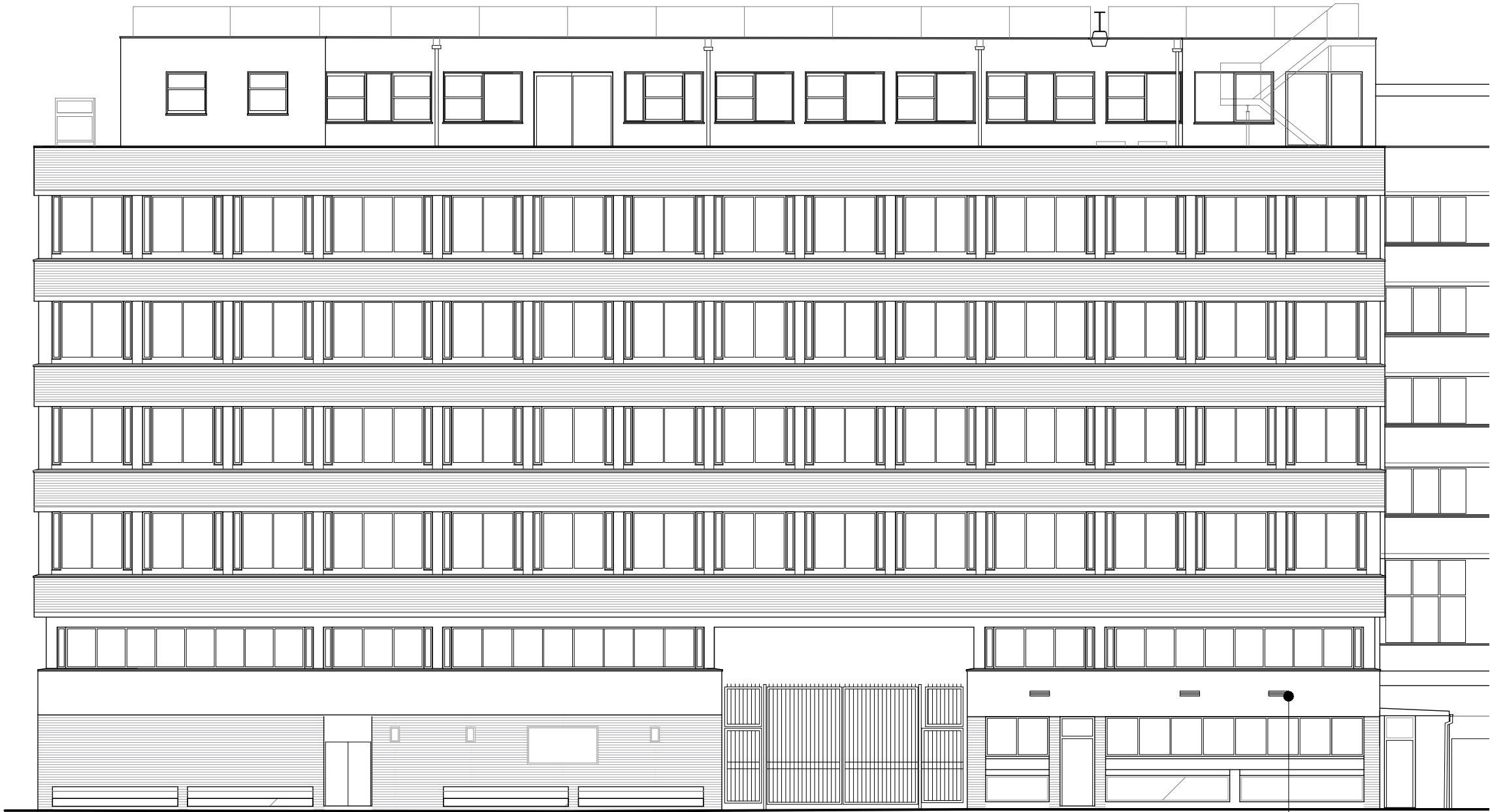
1 Proposed Side (East) Elevation Scale: 1:150

3no. new 600x150mm extract grilles in existing wall (colour: grey to match existing grilles/window frames)