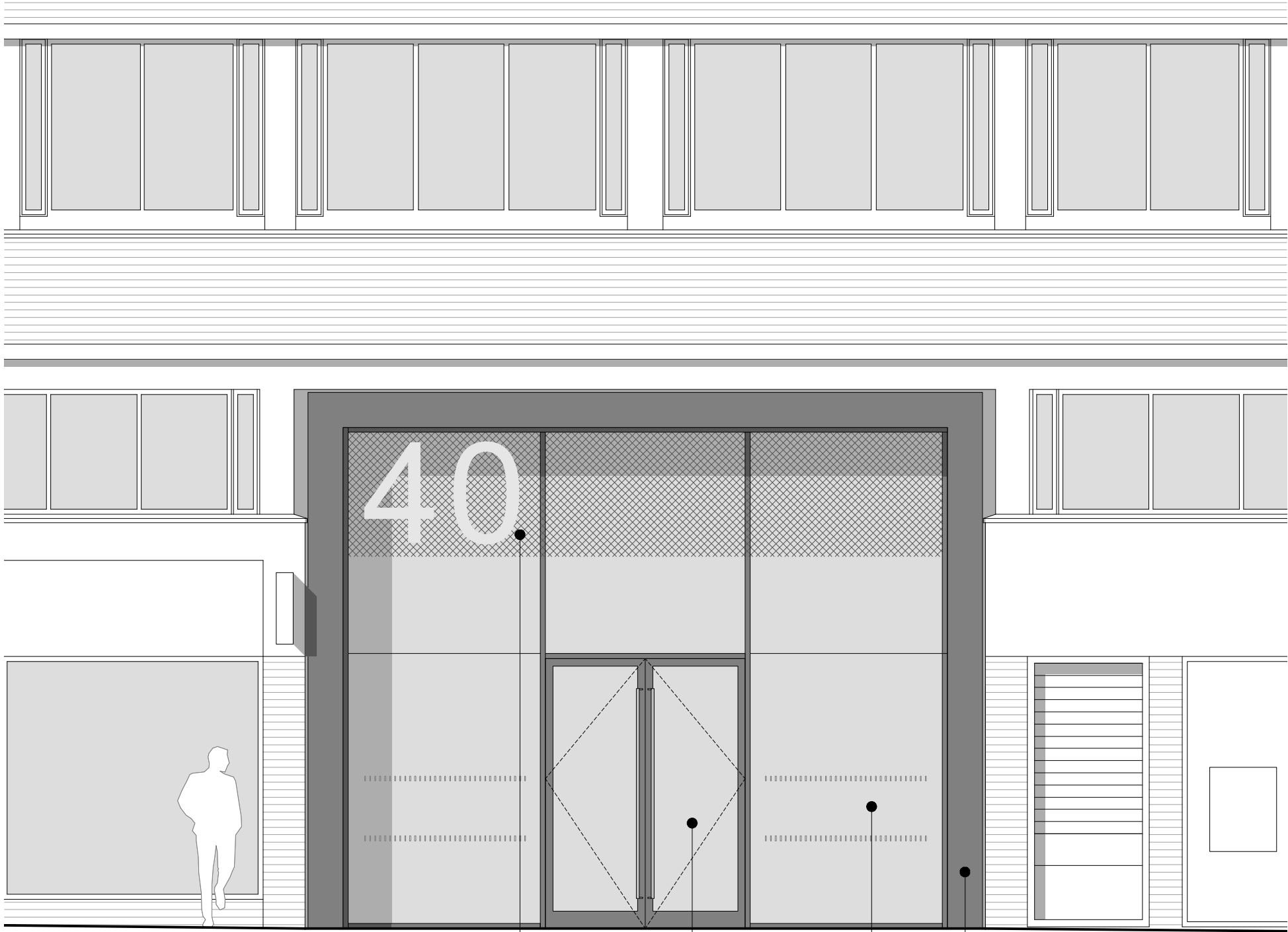
1 Proposed Front Elevation Scale: 1:50

New entrance portico clad in PPC aluminium (colour: black with green glazed tile reveals)