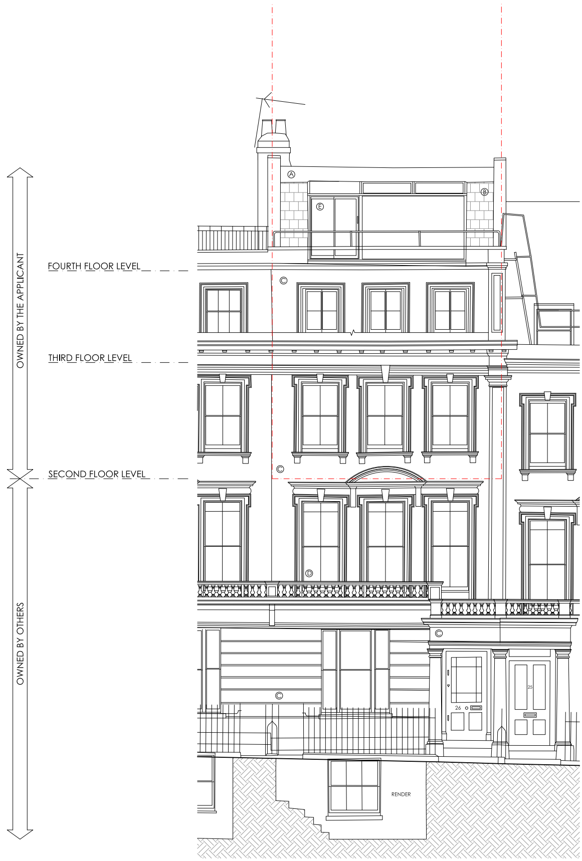
EXISTING FRONT ELEVATION (TO REMAIN AS EXISTING) 1:50@A1