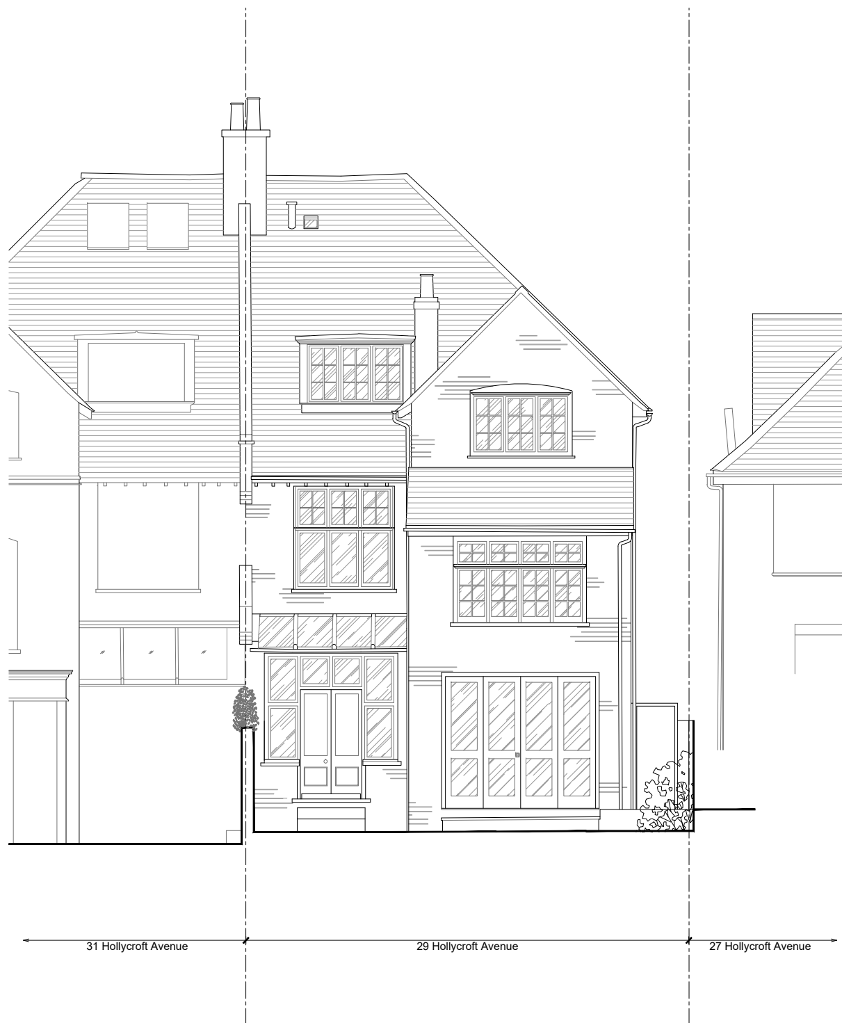
Existing Rear Elevation Scale 1:50@A1 Scale 1:100@A3

NOTES 1. ALL DIMENSIONS AND LEVELS TO BE CHECKED ON SITE PRIOR TO SETTING OUT OR MANUFACTURE. ANY DISCREPANCIES BETWEEN SITE, DRAWING OR SPECIFICATION TO BE REPORTED TO THE ARCHITECT IMMEDIATELY. 2. THIS DRAWING IS THE COPYRIGHT OF THE OWNERS