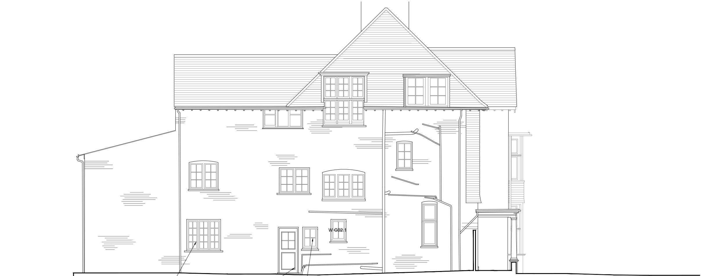
Proposed side elevation of no 29

NOTES 1. ALL DIMENSIONS AND LEVELS TO BE CHECKED ON SITE PRIOR TO SETTING OUT OR MANUFACTURE. ANY DISCREPANCIES BETWEEN SITE, DRAWING OR SPECIFICATION TO BE REPORTED TO THE ARCHITECT IMMEDIATELY. 2. THIS DRAWING IS THE COPYRIGHT OF THE OWNERS